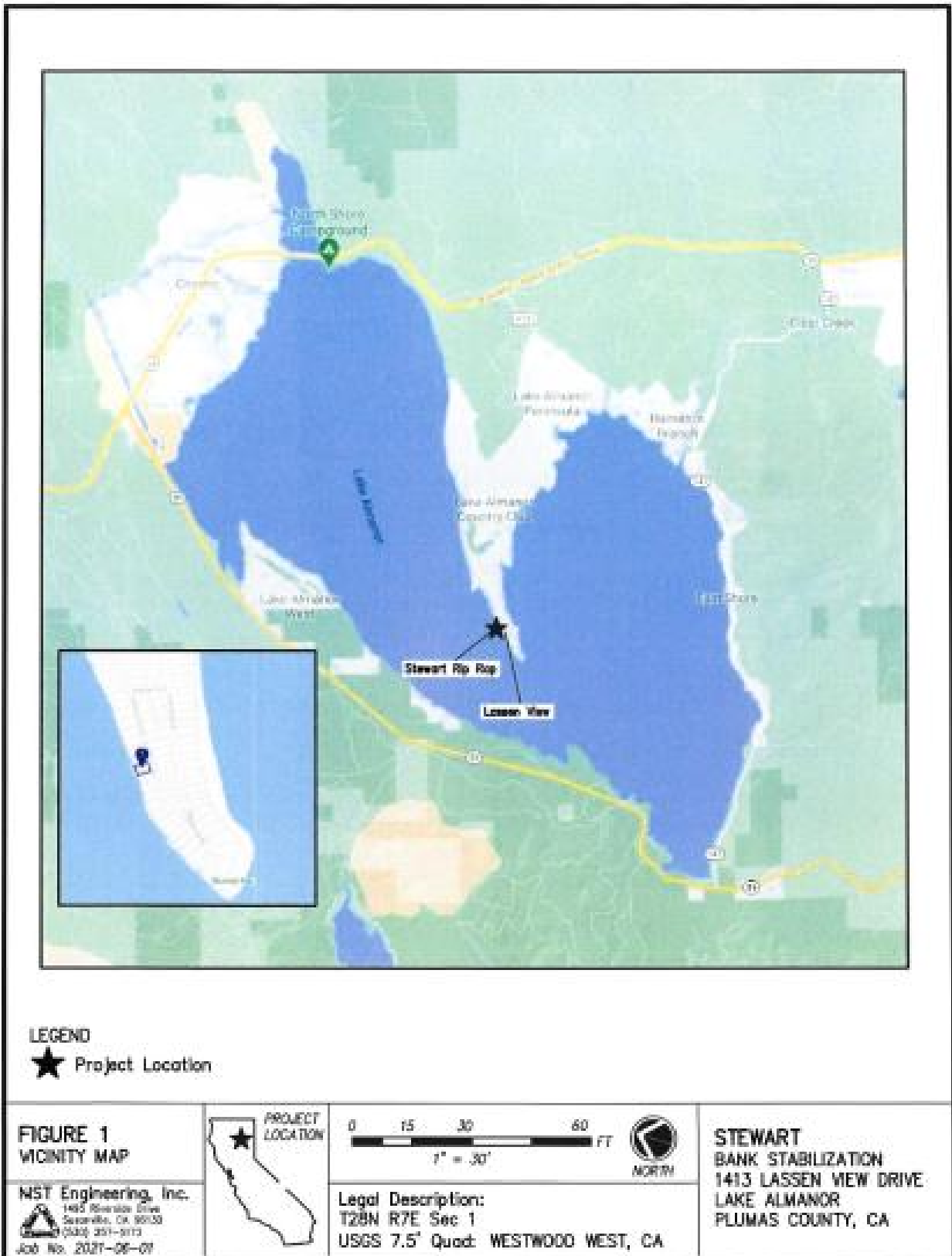
Figure 1. Project Location Map