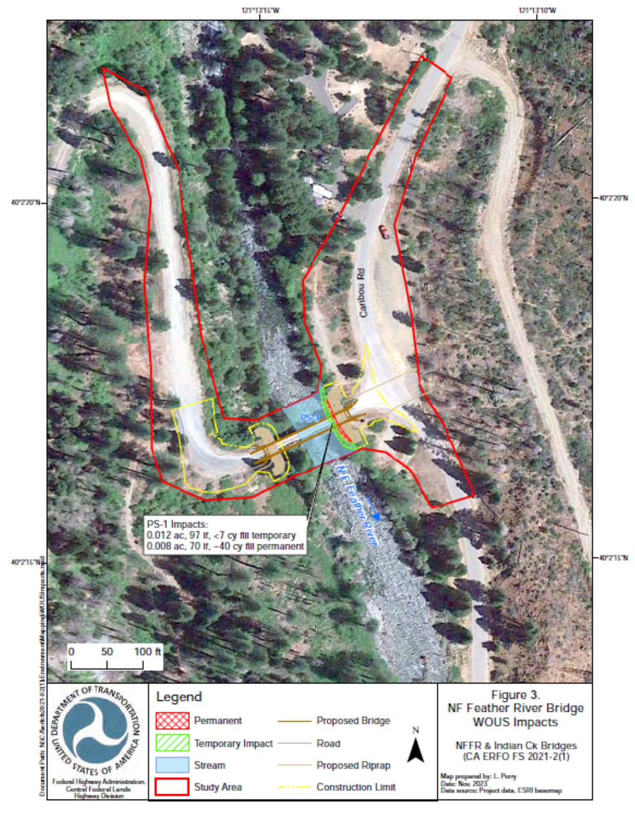
Figure 3. North Fork Feather River Impact Location