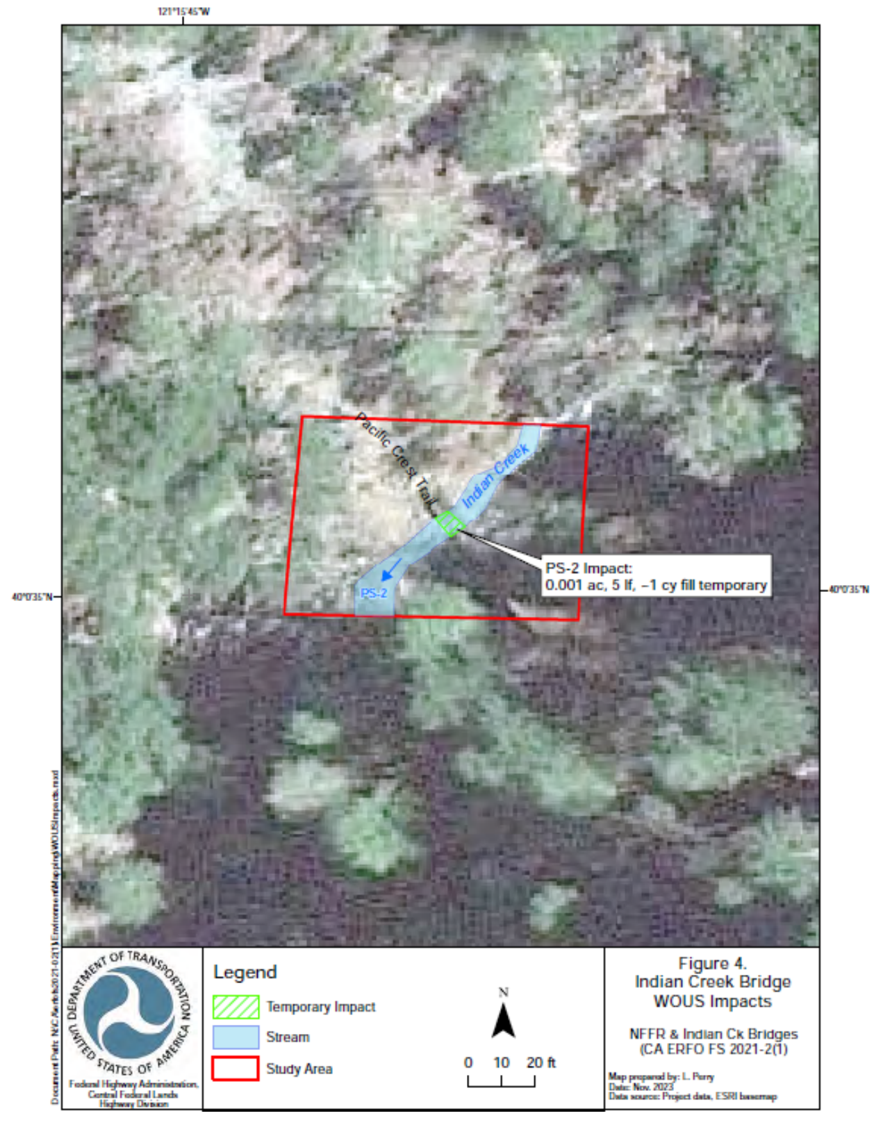
Figure 4. Indian Creek Impact Location