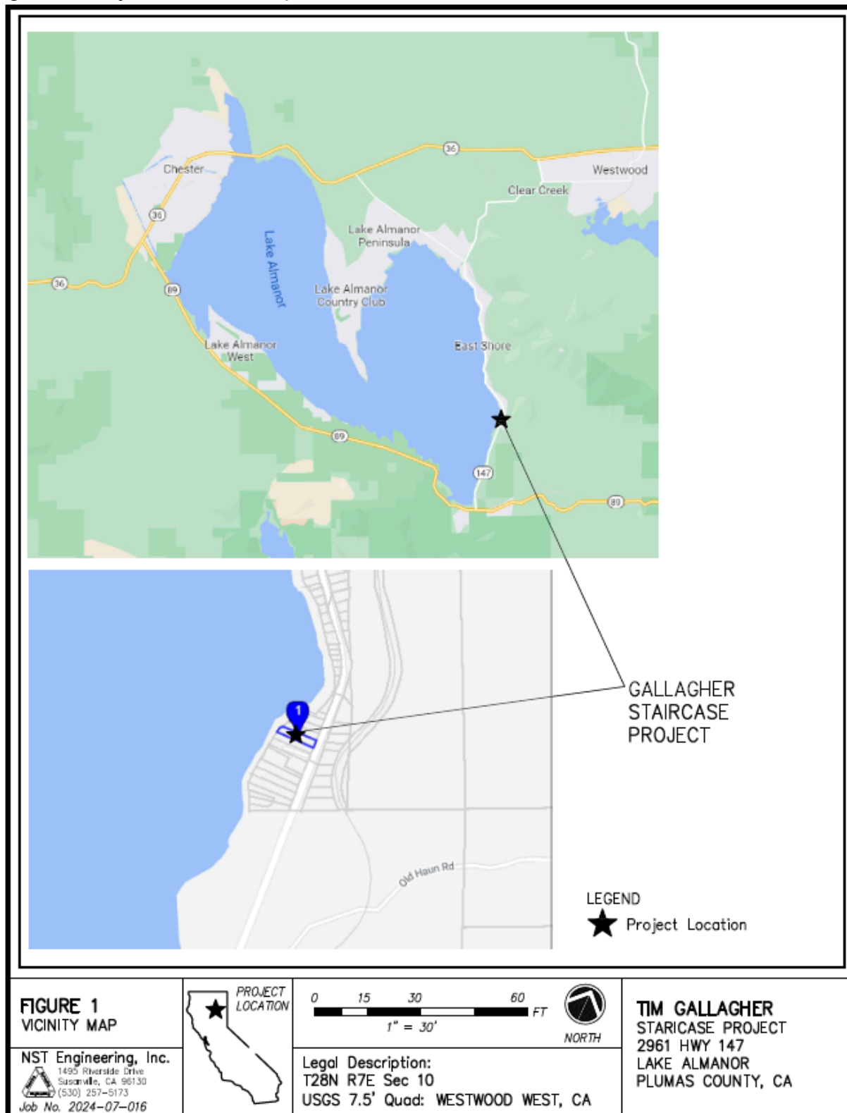
Figure 1: Project Location Map