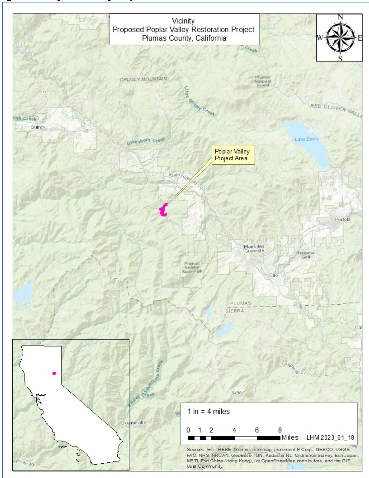
Figure 1. Project Vicinity Map