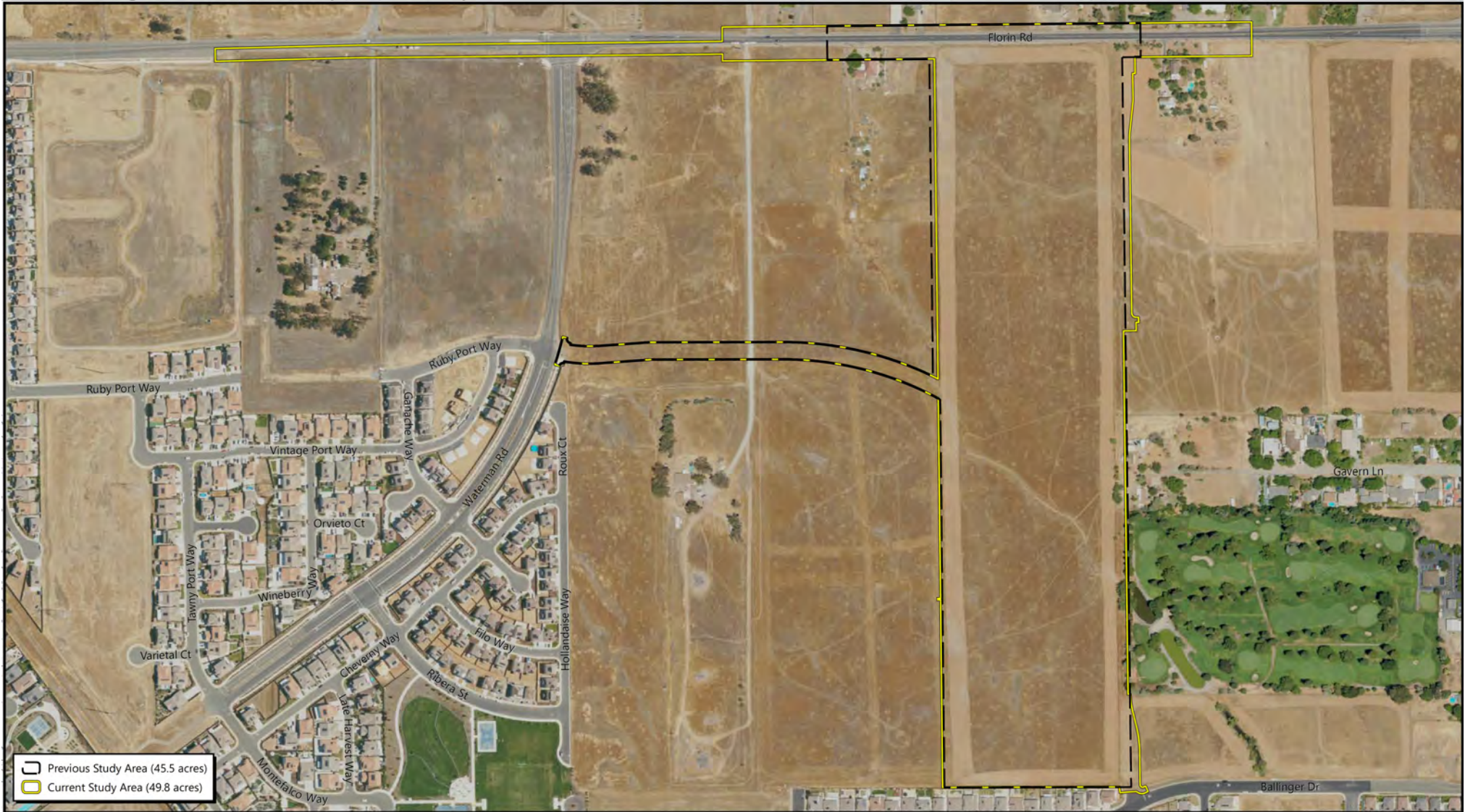
Figure 1: Revised Project Boundary