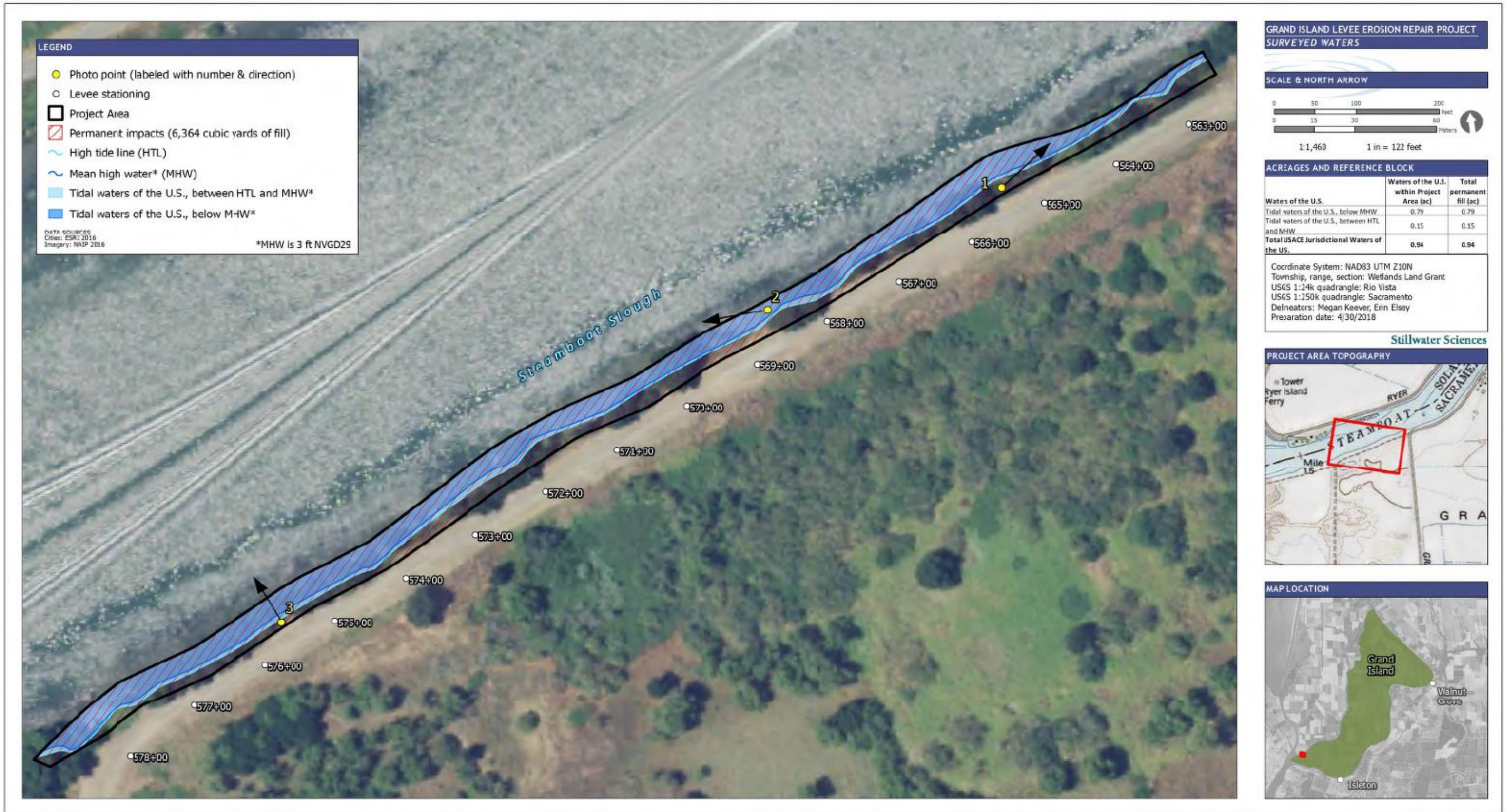
Figure 2 – Site Impact Map