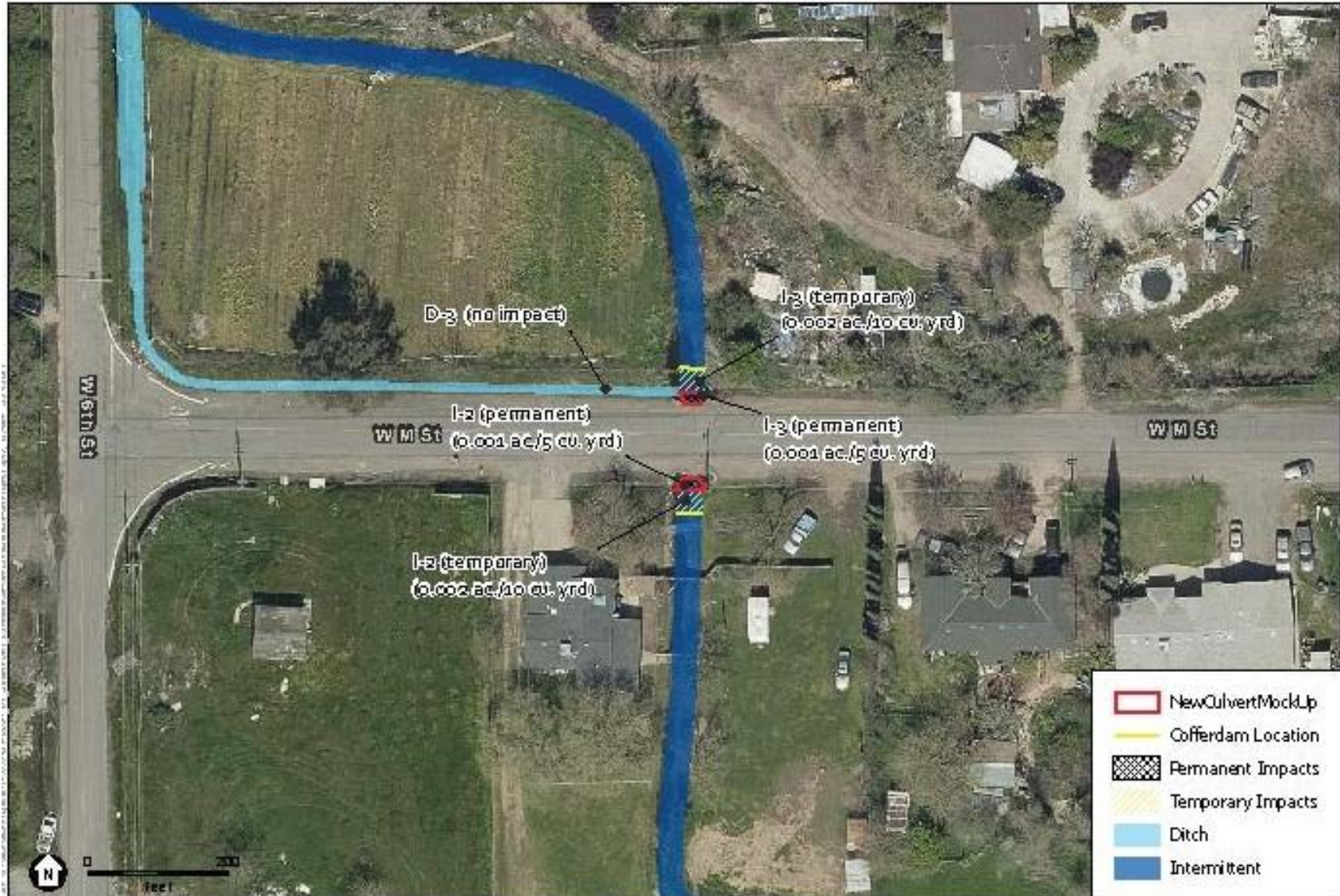
Figure 2- Impacts to Aquatic Resources