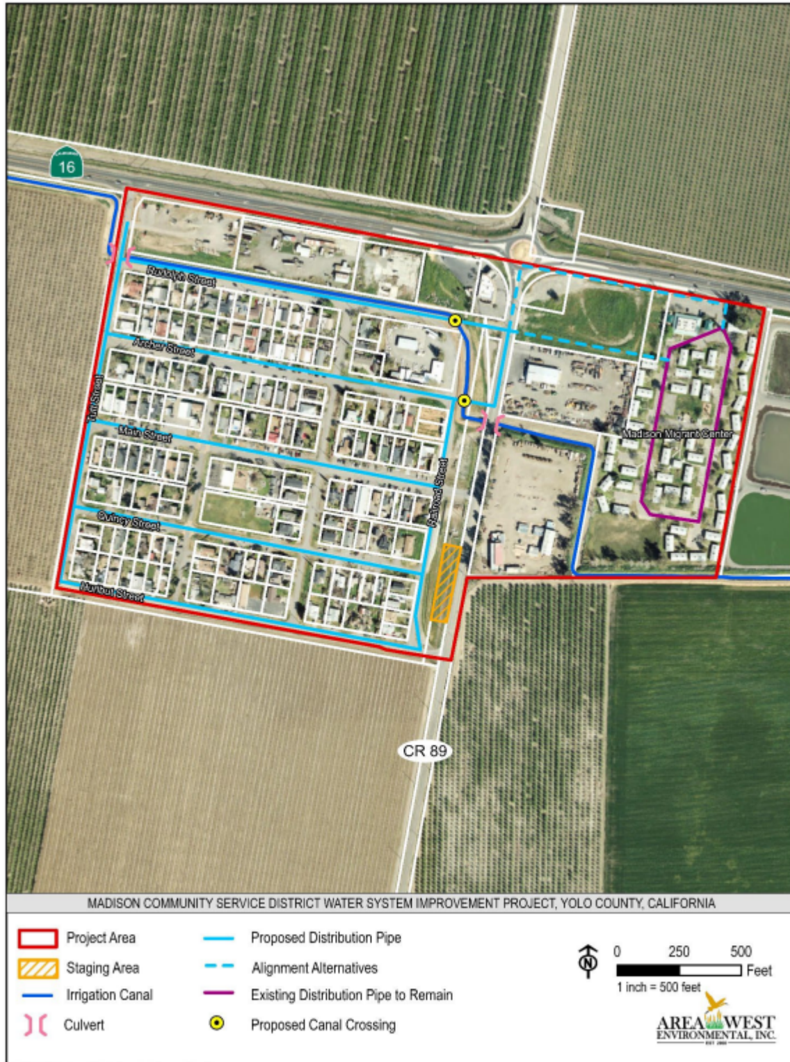
Figure 3. Project Components