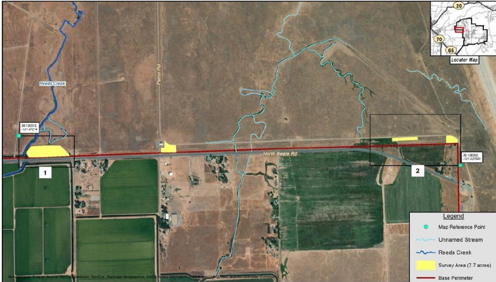
Figure 1: Project Location Map