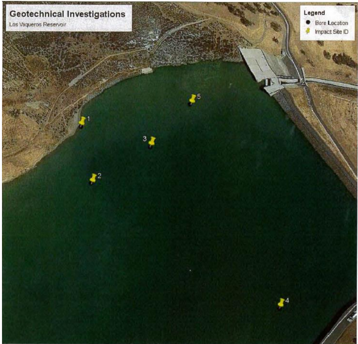
Figure 2 – Site Impact Map