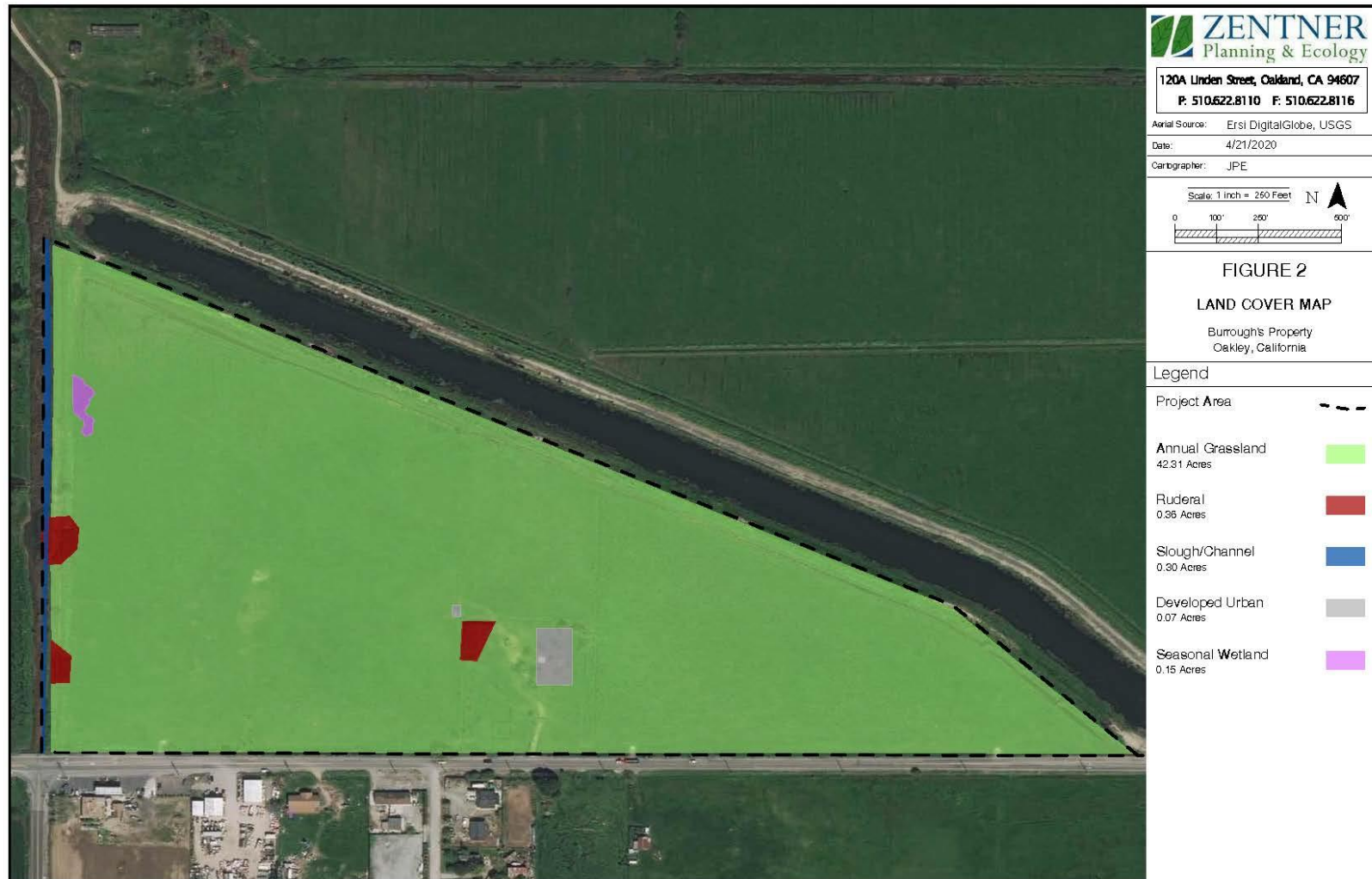
Figure 2 – Impacts to Aquatic Resources Map