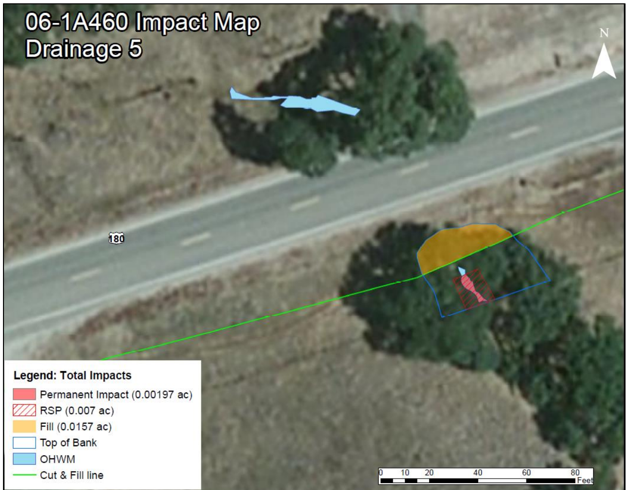
Figure 3: Project Impacts Map Drainage 5