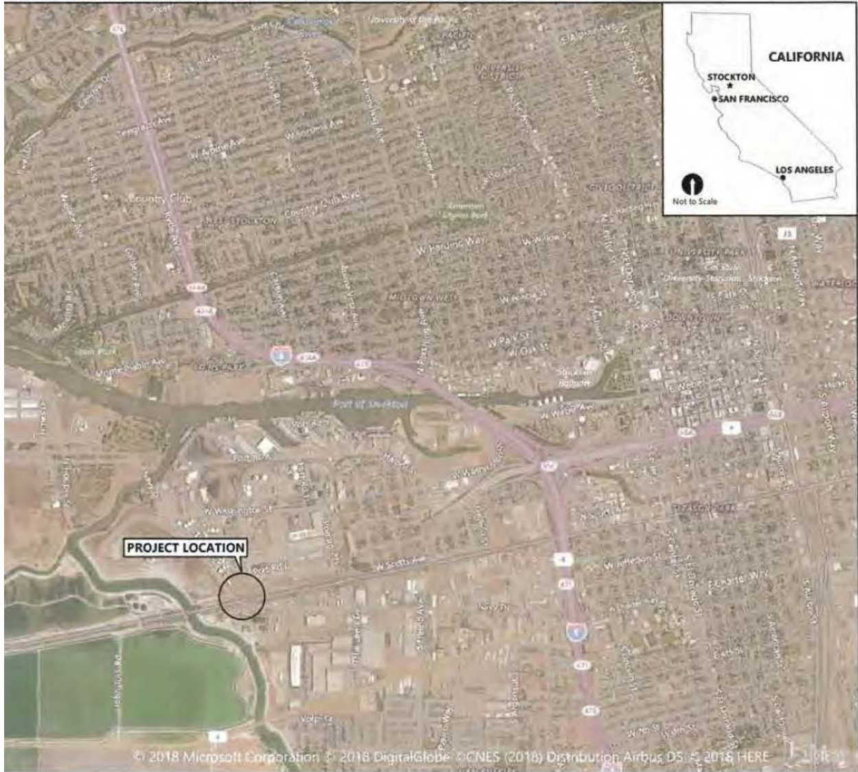
Figure 1: Project Vicinity Map