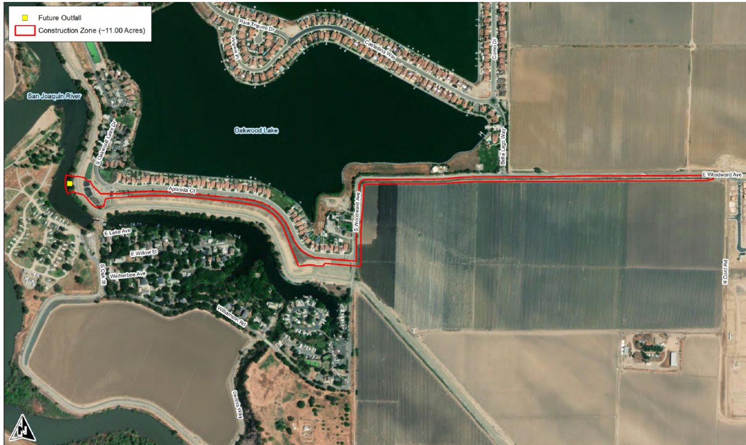
Figure 1: Project Location Map