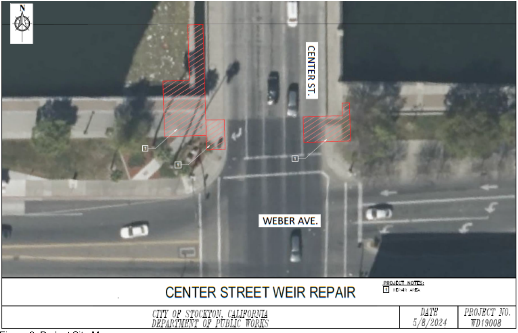
Figure 2: Project Site Map