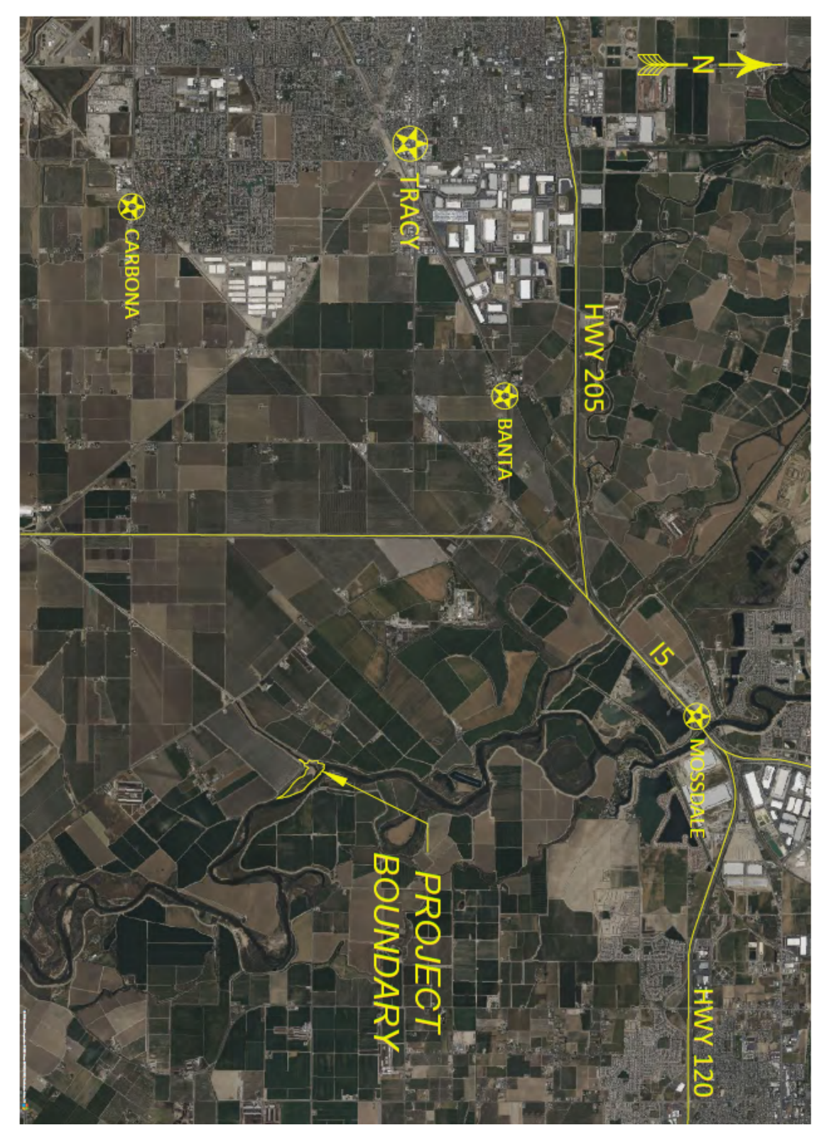
Figure 1: Project Vicinity Map