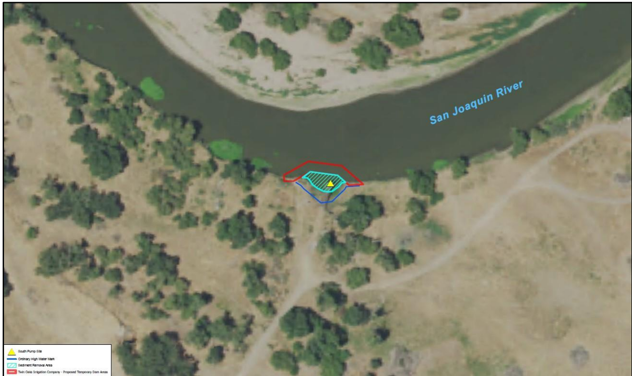
Figure 3: South Pump Plant Impacts