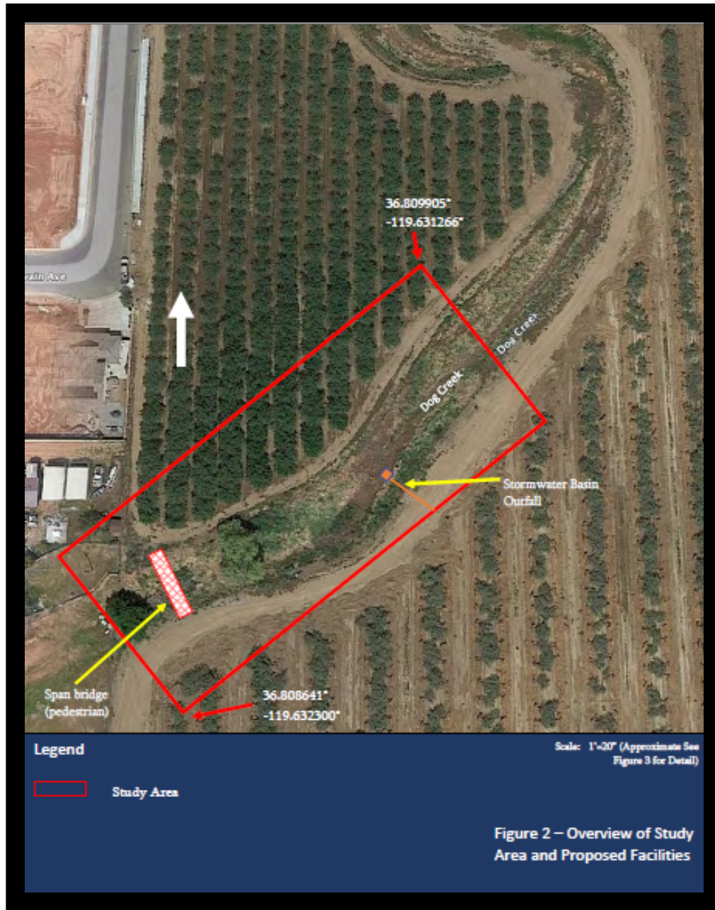
Figure 2: Project Area and Proposed Facilities