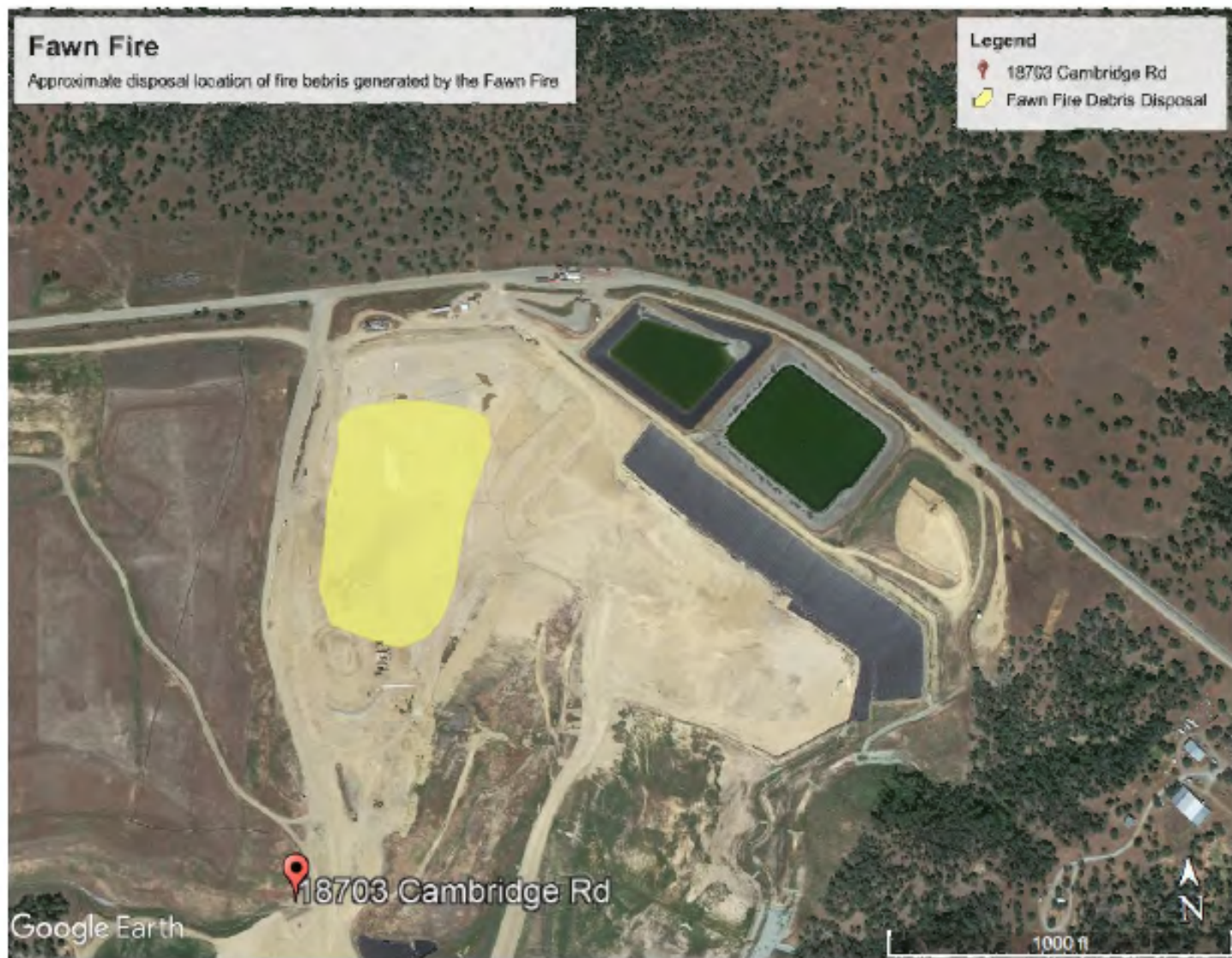
Figure 1 Approximate limits of fire debris accepted in the cleanup of the fawn fire. Types of materials accepted: debris and ash from a structure burned in a wildfire area. Fire debris may contain metal, concrete, building materials, and contaminated soils.