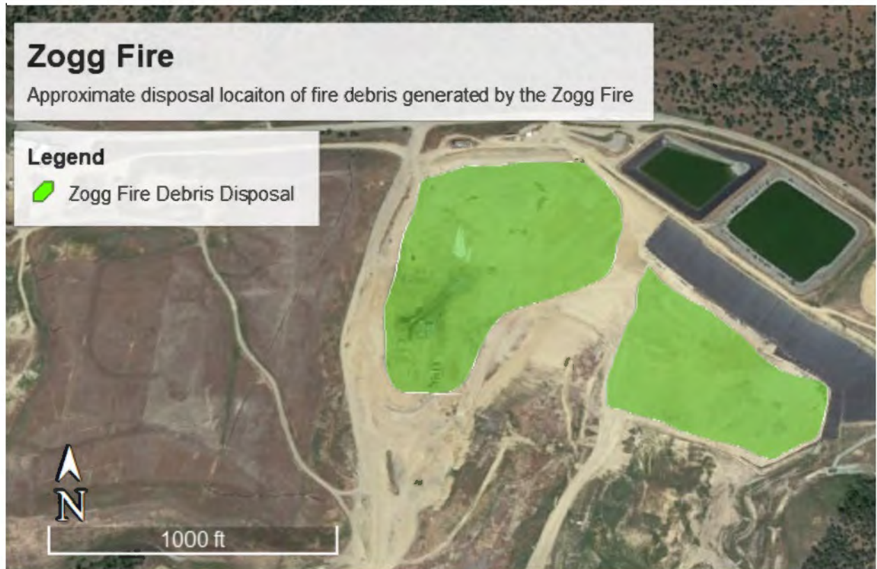
Figure 1 Approximate limits of fire debris accepted in the cleanup of the Zogg Fire. Types of materials accepted: debris and ash from a structure burned in a wildfire area. Fire debris may contain metal, concrete, building materials, and contaminated soil