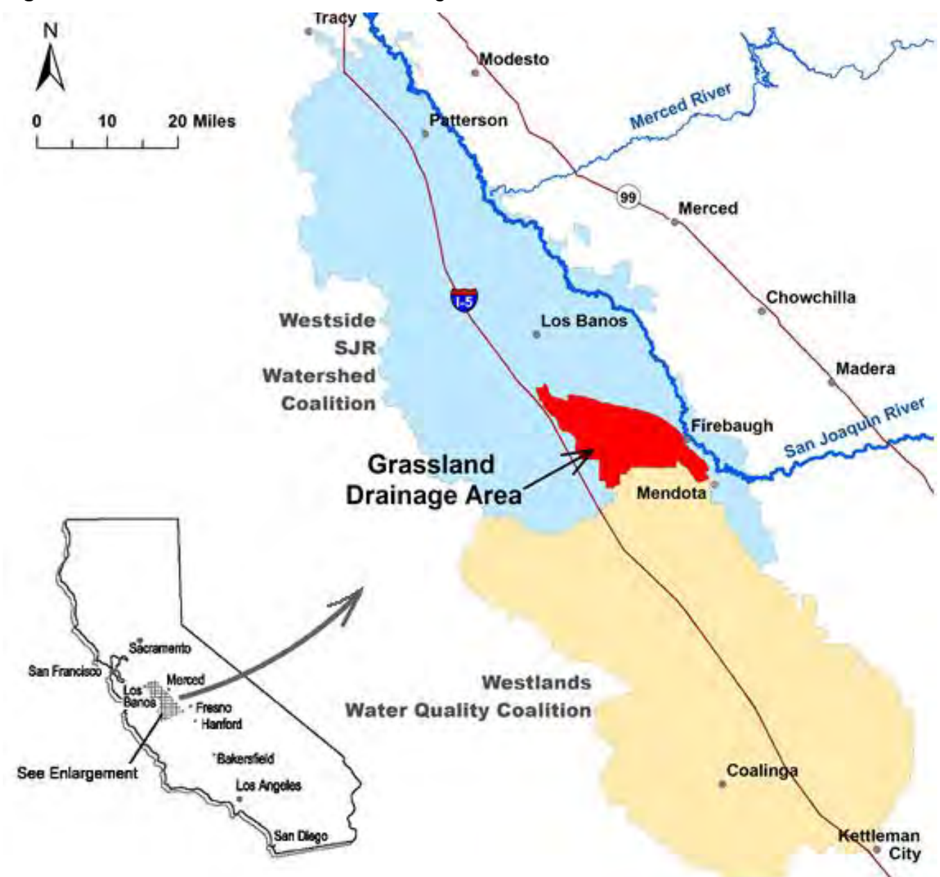
Figure 1 - Location of the Grassland Drainage Area

The Grassland watershed overlies the Delta-Mendota groundwater subbasin which consists of the Tulare Formation, terrace deposits, alluvium, and flood-basin deposits. The Grassland Drainage Area primarily overlies the Tulare Formation. The primary aquifer system occurs in unconsolidated alluvial and continental deposits of the Tulare Formation. The Tulare Formation is composed of beds, lenses, and tongues of clay, sand and gravel that have been alternately deposited in oxidizing and reducing environments. The Corcoran clay of this formation underlies the basin at depths ranging from 100 to 500 feet and acts as a confining bed.