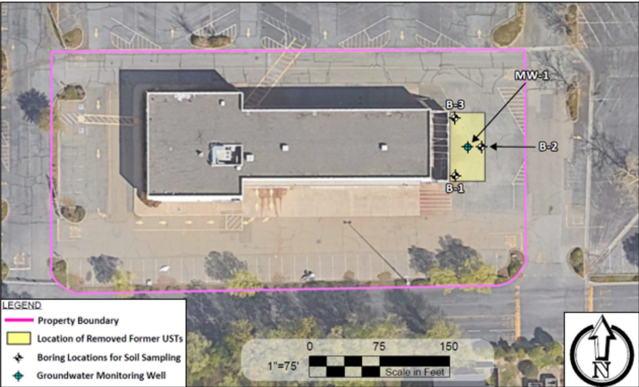
Figure 1: Site map from the 11 December 2023 Phase II Limited Site Investigation report (available on GeoTracker)