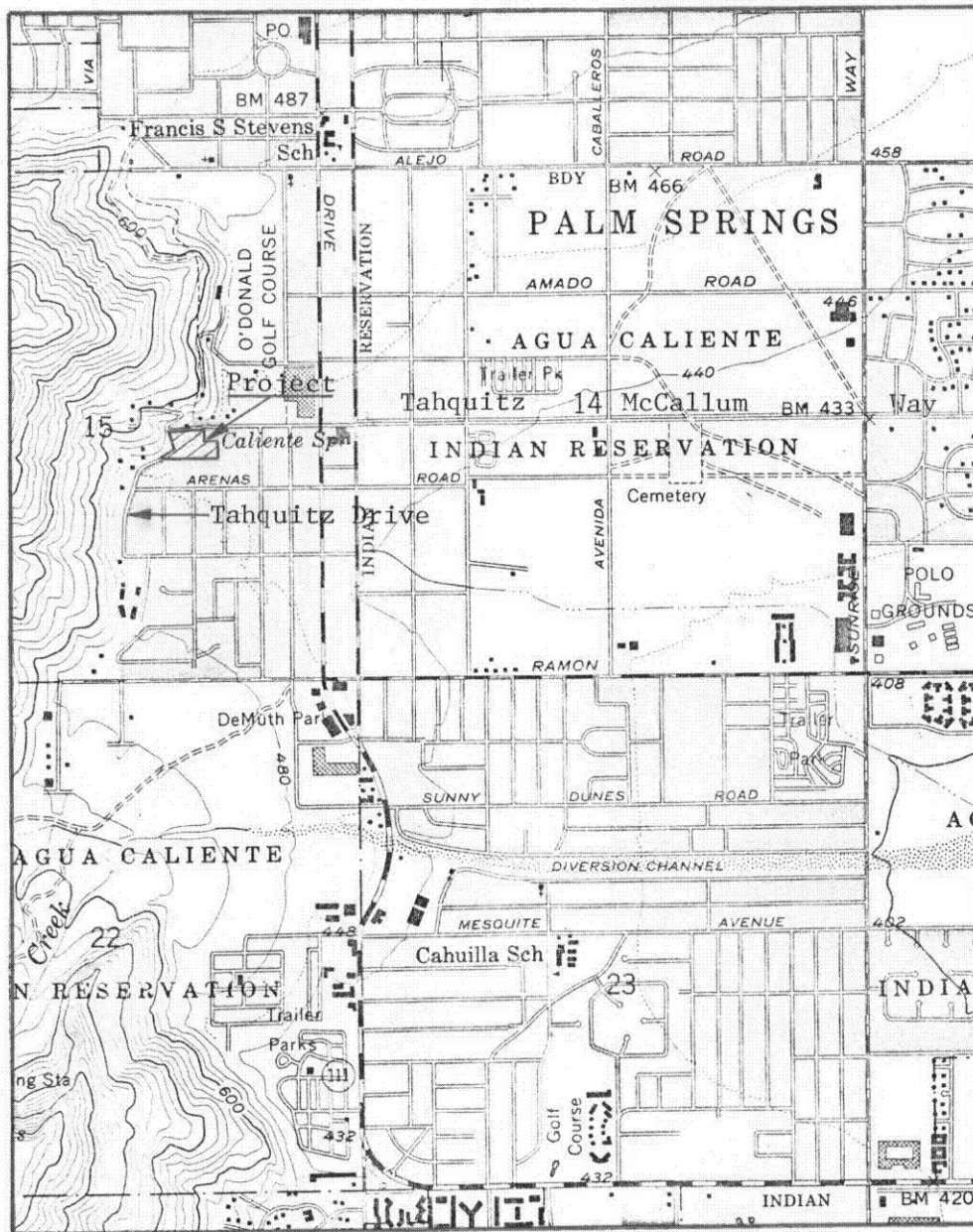
SITE MAP TAHQUITZ-McCALLUM PROPERTY City of Palm Springs - Riverside County NW 1/4 of the SE 1/4 of Section 15, T4S, R4E, SBB&M USGS Palm Springs 7.5 min. Topographic Map