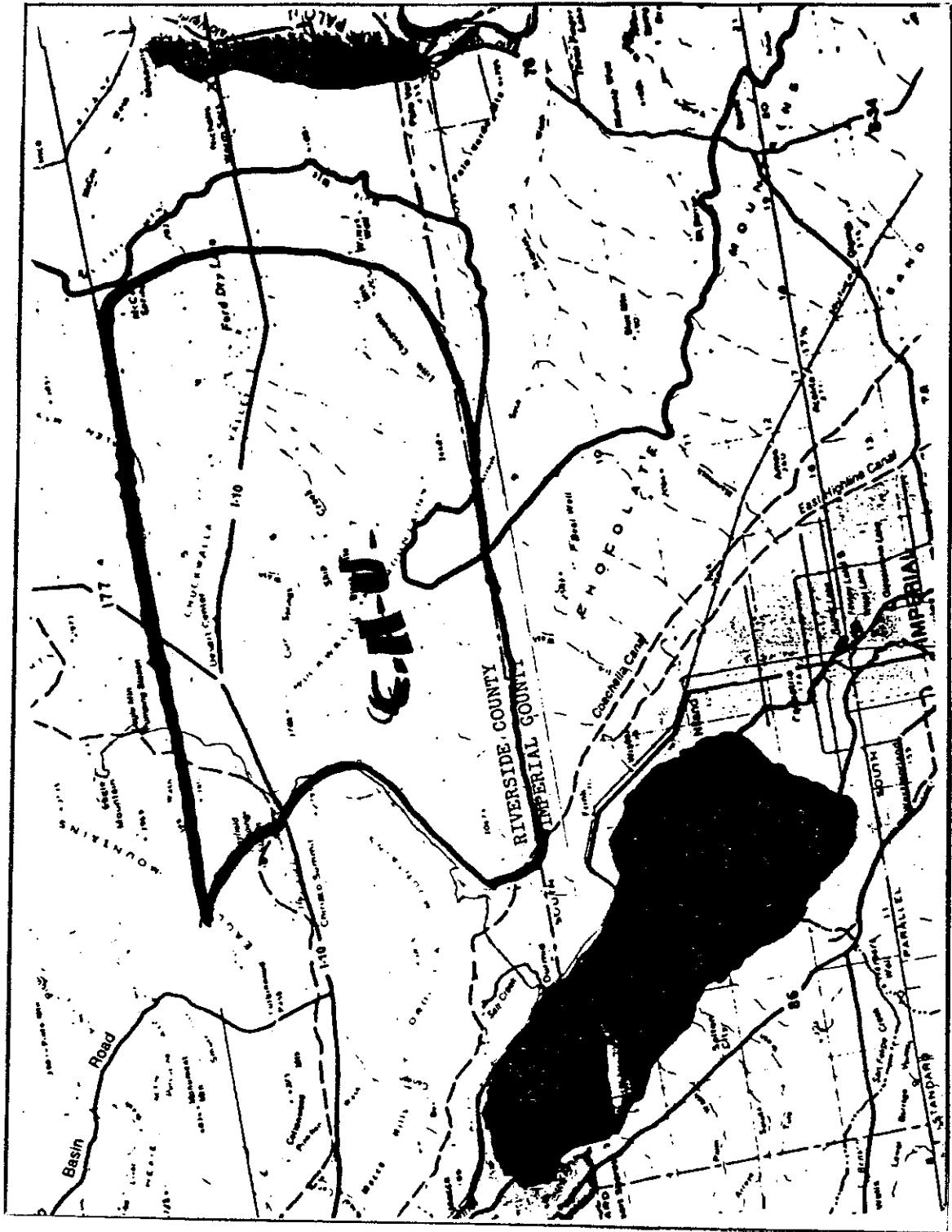
MAP PIMA GRO SYSTEMS, INC. CHUCHWALLA HYDROLOGIC UNIT