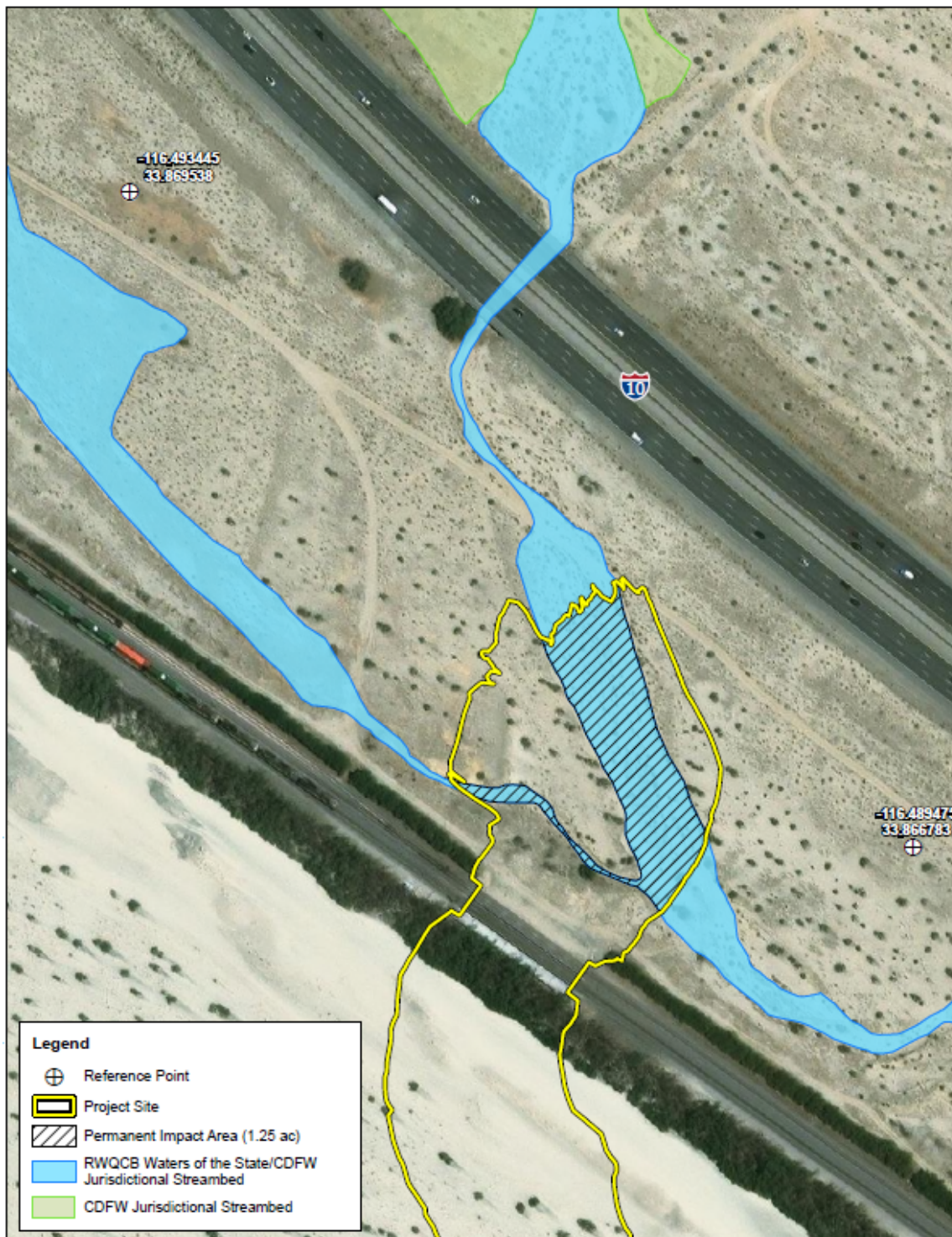
Figure 3: Impact site 1.