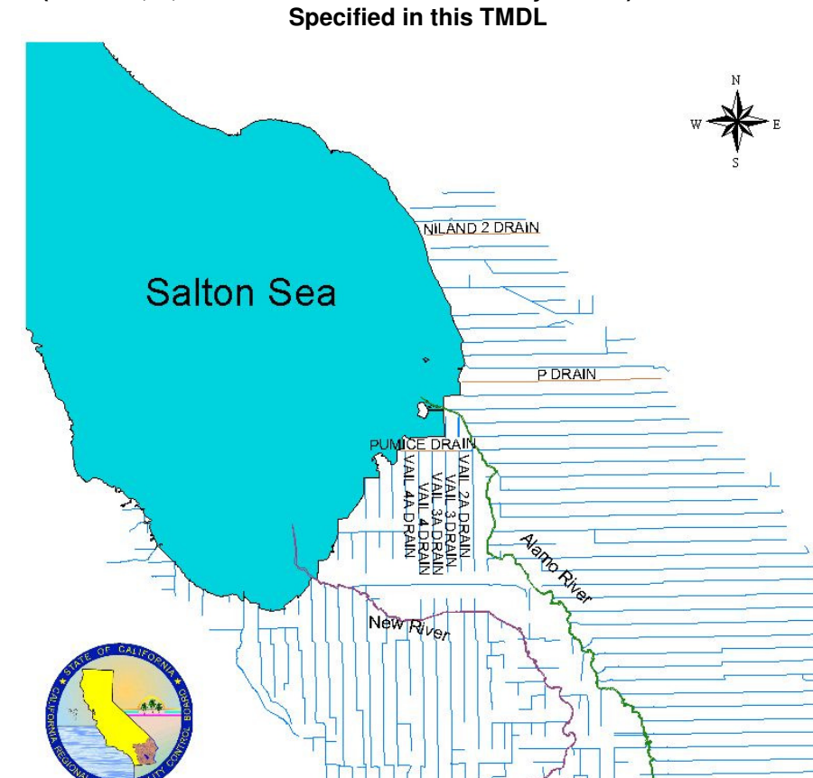
Figure D-1: Drains (Niland 2, P, and Pumice and Their Tributary Drains) for Which Allocations Have Been Specified in this TMDI