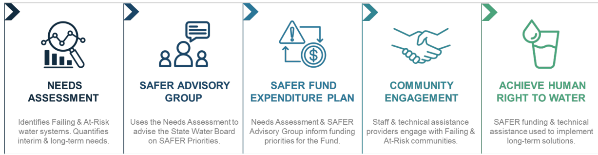
Figure 2: How the Needs Assessment is Utilized by the SAFER Program

The Needs Assessment serves to highlight and track progress in achieving safe drinking water in communities that have historically lacked access. It also serves to document the pace of implementing drinking water solutions, measure water system performance to encourage resiliency, explore sustainable long-term solutions like consolidation, and estimate the cost of implementing these solutions.