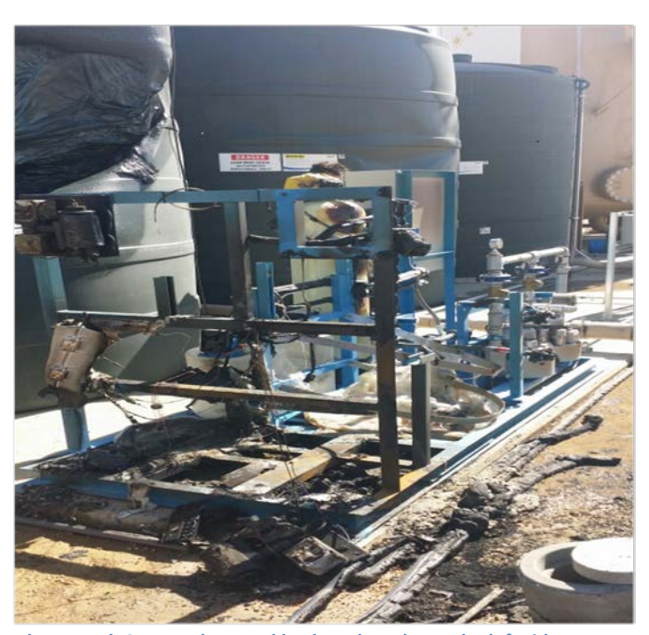
Photograph 2 - Two damaged backwash tanks on the left side. In lower foreground is the destroyed drinking water filtration system. At the right center is an undamaged treated water storage tank (black color). At the far right in a tan color is one of the

propagation and acclimation will. According to BKT, the treatment process will still be on time or be delayed at most by couple of weeks.