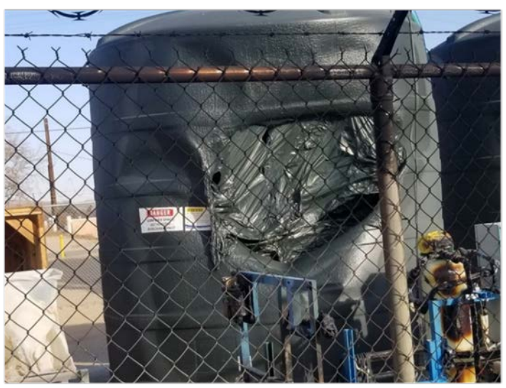
Photograph 1 - Damaged backwash tank

BKT, on its own initiative, will cover all costs of damage resulting from fire, including equipment replacement and all repairs. BKT assured Water Board staff that they will make every effort to minimize the inevitable delay that is caused by the fire. Since the vessels are not damaged, the biological treatment acclimation process will not be affected. The propagation of vessels with bacteria and acclimation will take about a month before treatment can start. BKT is working simultaneously on the repairs of damaged equipment, which would take approximately the same amount of time as