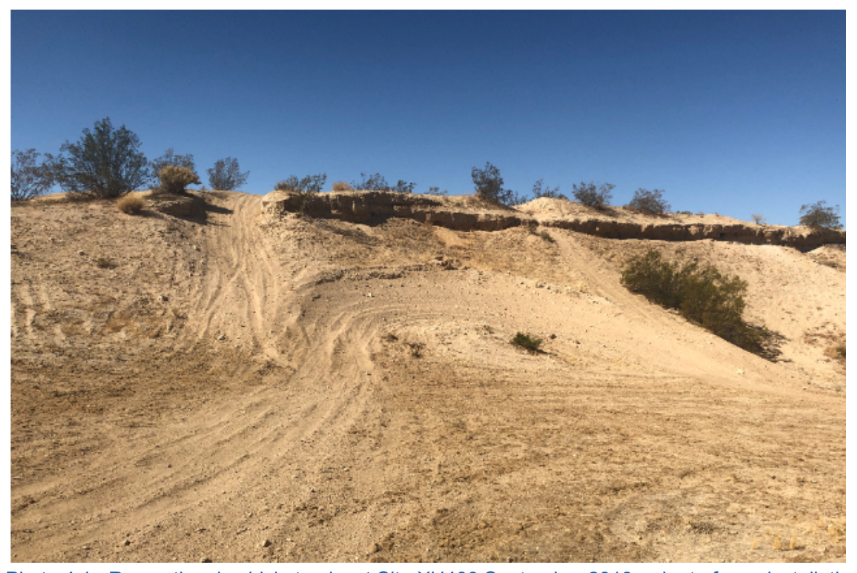
Photo 4.1: Recreational vehicle tracks at Site XU400 September 2019, prior to fence installation.

However, in a September 2019 site visit, the regulators saw visual evidence thatSite XU400 was being used for off-road vehicle recreation (Photo 4.1) and noted that a large residential development is only 2,000 feet from the site. The site was unfenced, and the Air Force's warning signs were not deterring trespassers. In September 2019, Water Board staff and the Department of Toxic Substances Control staff each sent letters to the Air Force requesting that a fence be immediately installed around the portion of the site with remaining munitions hazards. The Air Force agreed and finished fencing that portion of Site XU400 in February 2020 (Figure 4.1). The fence consists of 4-strand barbed wire approximately 4 feet high, with rolled concertina wire at the inside base of the barbed wire (Photo 4.2), effectively preventing public access.