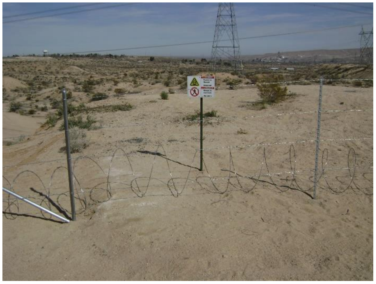
Photo 4.2: Fencing and signage around portion of Site XU400, March 2020.