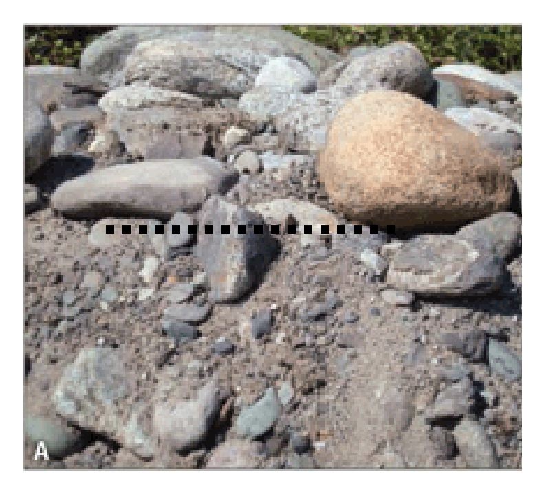
Figure 1. Typical surface versus subsurface particle size characteristics in gravel bed river substrate.

Currently we have the engineering criterion of a maximum of 20% fines by weight to provide required streambed permeability characteristics. Unfortunately, we have no information on natural surface or subsurface substrate characteristics in the project area or in a similar geomorphic setting nearby at this time. These data will serve as baseline characteristics for comparison with the constructed channel. Therefore preconstruction field data (surface and bulk sampling) in the project area also will be included so that we can answer these two questions: