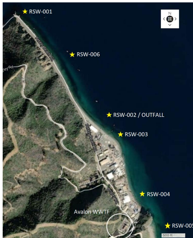
Figure E-2. Locations of Receiving Water Monitoring Stations