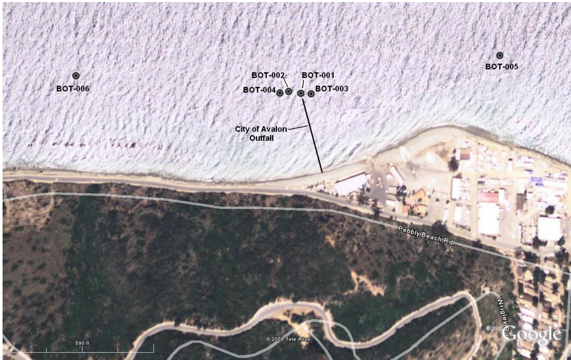
Figure E-1. Locations of Bottom Sediment Monitoring Stations