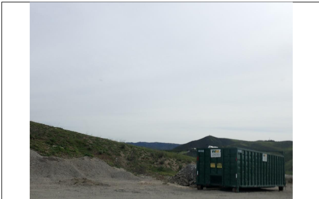
Photograph 10 Dumpster and Staged Soil Piles on Pad