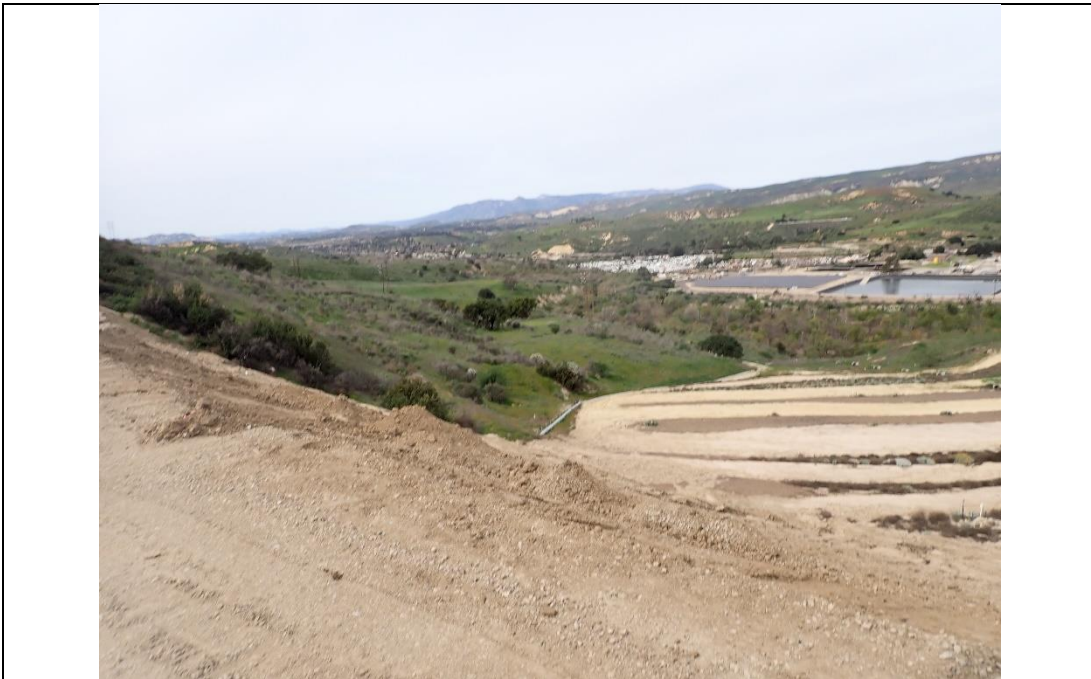
Photograph 6 Graded Pad / Landfill Below and Drainage Pipe Shown