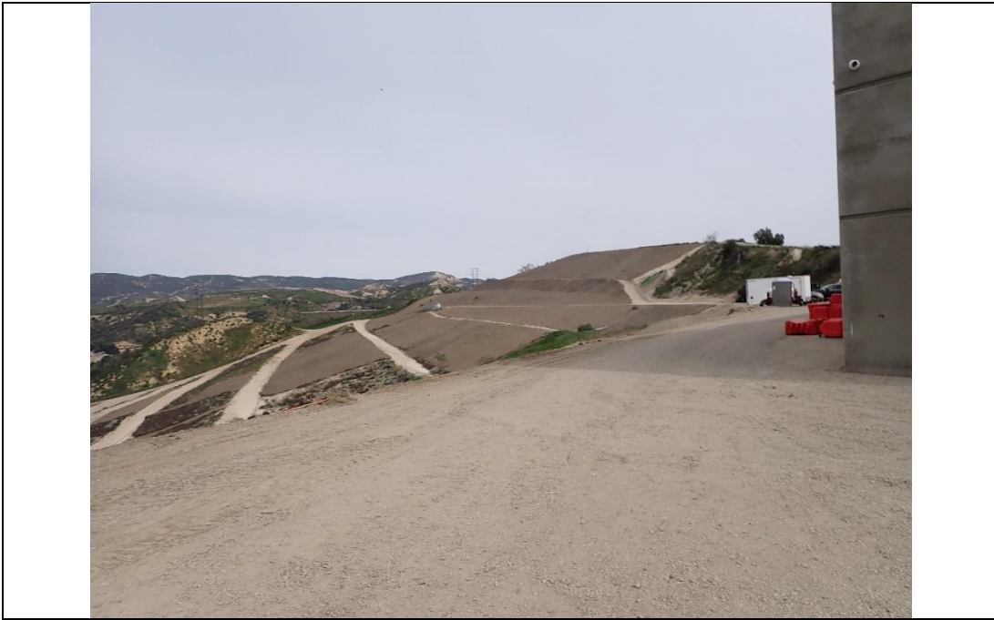
Photograph 5 Completed Building on Pad (Right) and Landfill (Ahead)