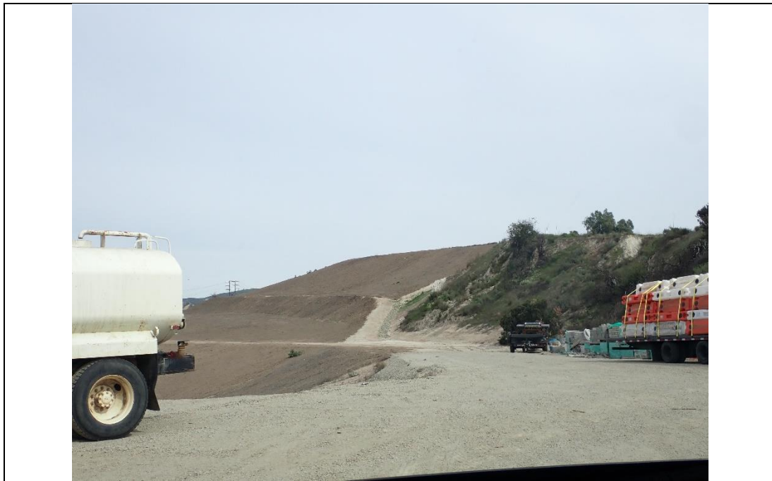
Photograph 9 Drainage Swale Leading to Pad (Appears to be Landfill Property / Unknown Boundary)