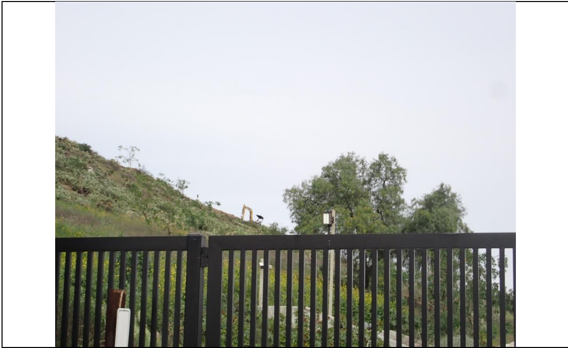
Photograph 1 Gated Entrance to Residence / Construction Equipment is Shown on Hillside Above