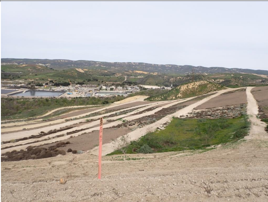
Photograph 7 Surveyor's Stake for Property Boundary Assessment (Results Not Provided to Staff) / Landfill Ahead in the Distance