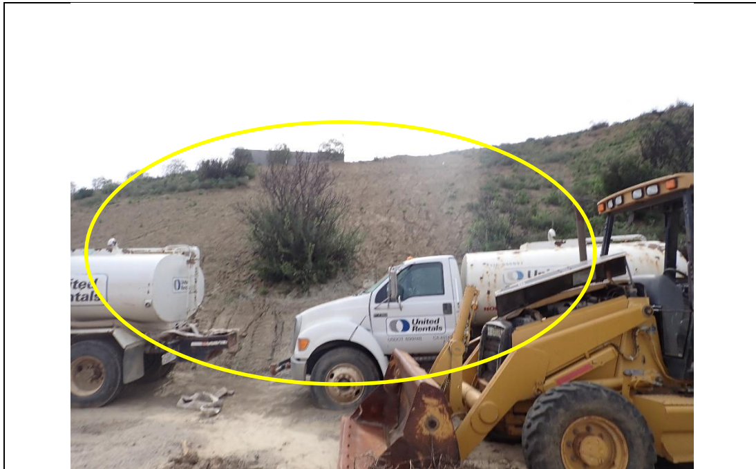
Photograph 4 Staged Equipment / Erosion on Hillside (Unsure if Grading Occurred with Rest of Project)