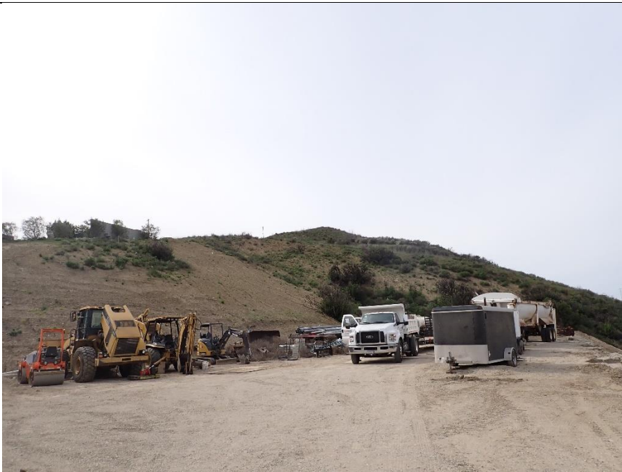
Photograph 8 Construction Equipment Staged on Pad