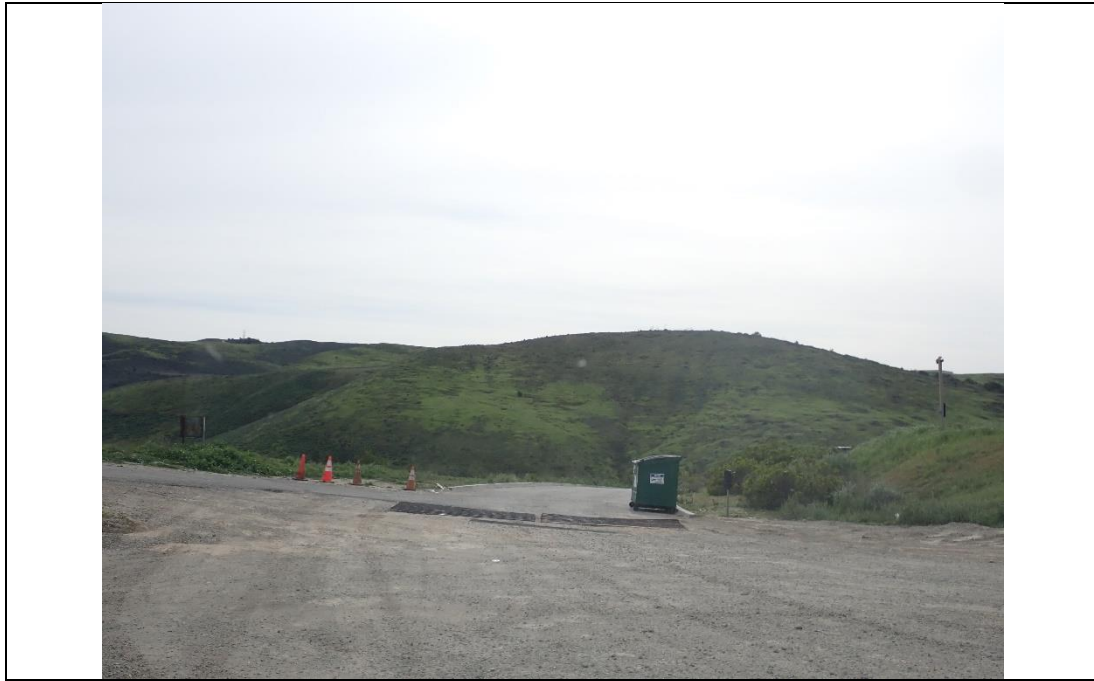
Photograph 11 Rumble Plates Installed Prior To Driveway