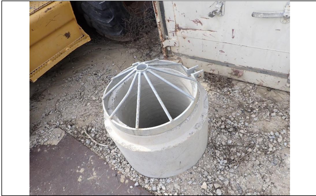
Photograph 3 Drain Inlet Riser Leading to Landfill Drainage Below