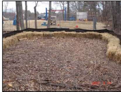
Barricade Utilizing Silt Fence and Hay Bales