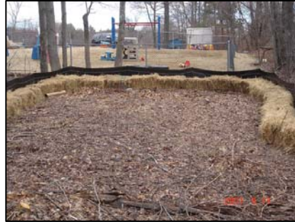
Barricade Utilizing Silt Fence and Hay Bales