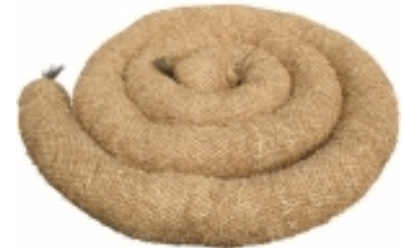
Synthetic and Straw Booms