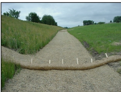
Mats and Wattle Erosion Protection