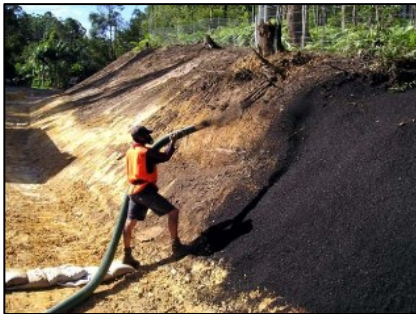
Utilization of Hose to Apply Groundwork Protection