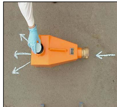
Typical Dechlorinator with De-Chlorination Tablet