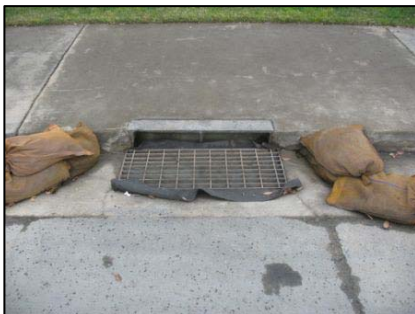
Filter Bag with Sandbags Protecting Municipal Sewer