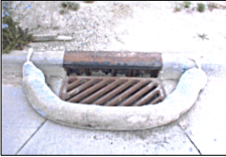
Wattle and Municipal Sewer Protection