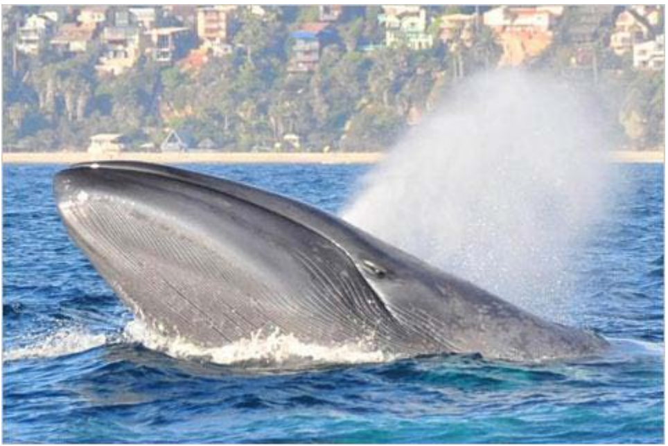
Safari/Marc Carpenter, via Associated Press

mixing zone, commonly referred to as the zone of initial dilution (ZID), the applicable water quality standards must be met. The zone of initial dilution is the boundary of the area where the discharge plume achieves natural buoyancy and first begins to spread horizontally. Discharged sewage is mostly freshwater, so it creates a buoyant plume that move upward toward the sea surface, entraining ambient sea water in the process. The wastewater/seawater plume rises through the water column until its density is equivalent to that of the surrounding water, at which point it spreads our horizontally. <a href="http://www.coastal.ca.gov/cd/CC-010-02.pdf">http://www.coastal.ca.gov/cd/CC-010-02.pdf</a> The relationship between wastewater/seawater plumes and the foraging behavior of federally protected marine mammals is not considered in the recent action by the SDRWQCB.