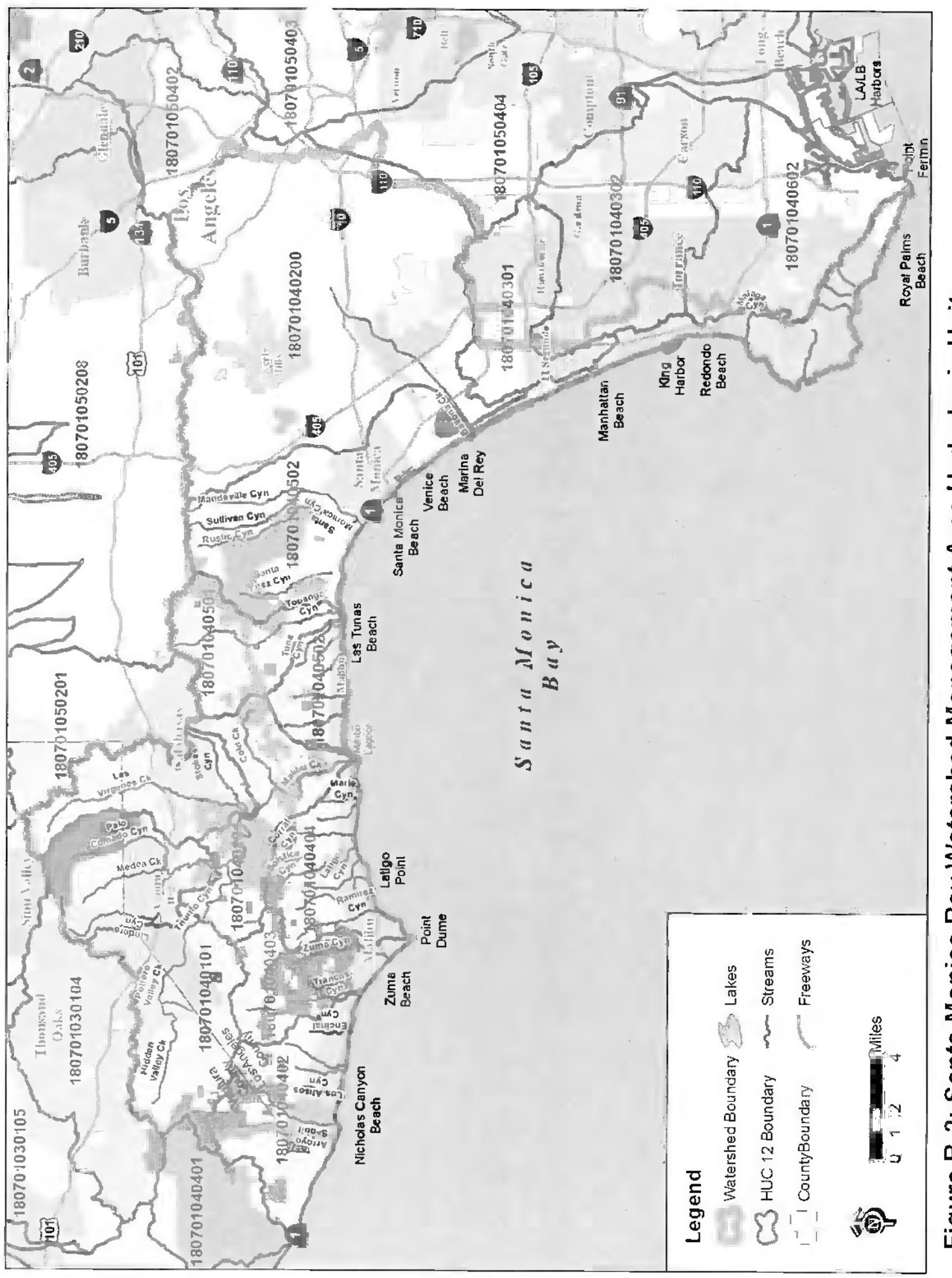
Figure B-2: Santa Monica Bay Watershed Management Area Hydrologic Units.