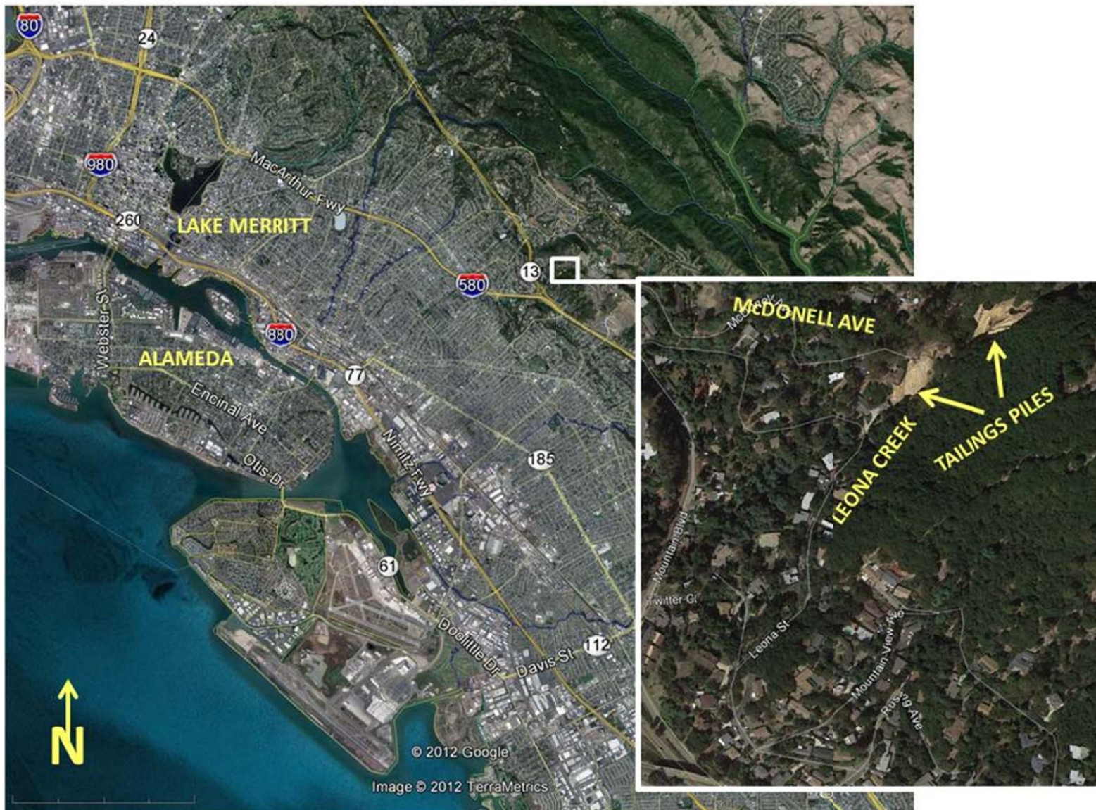
Figure 1. Site location