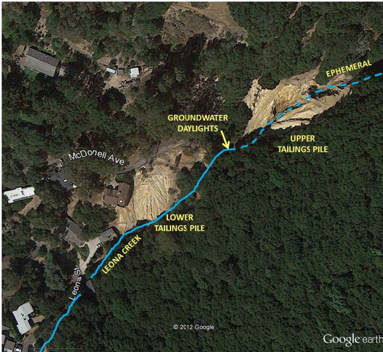
Figure 2. Leona Creek, headwaters on mine property