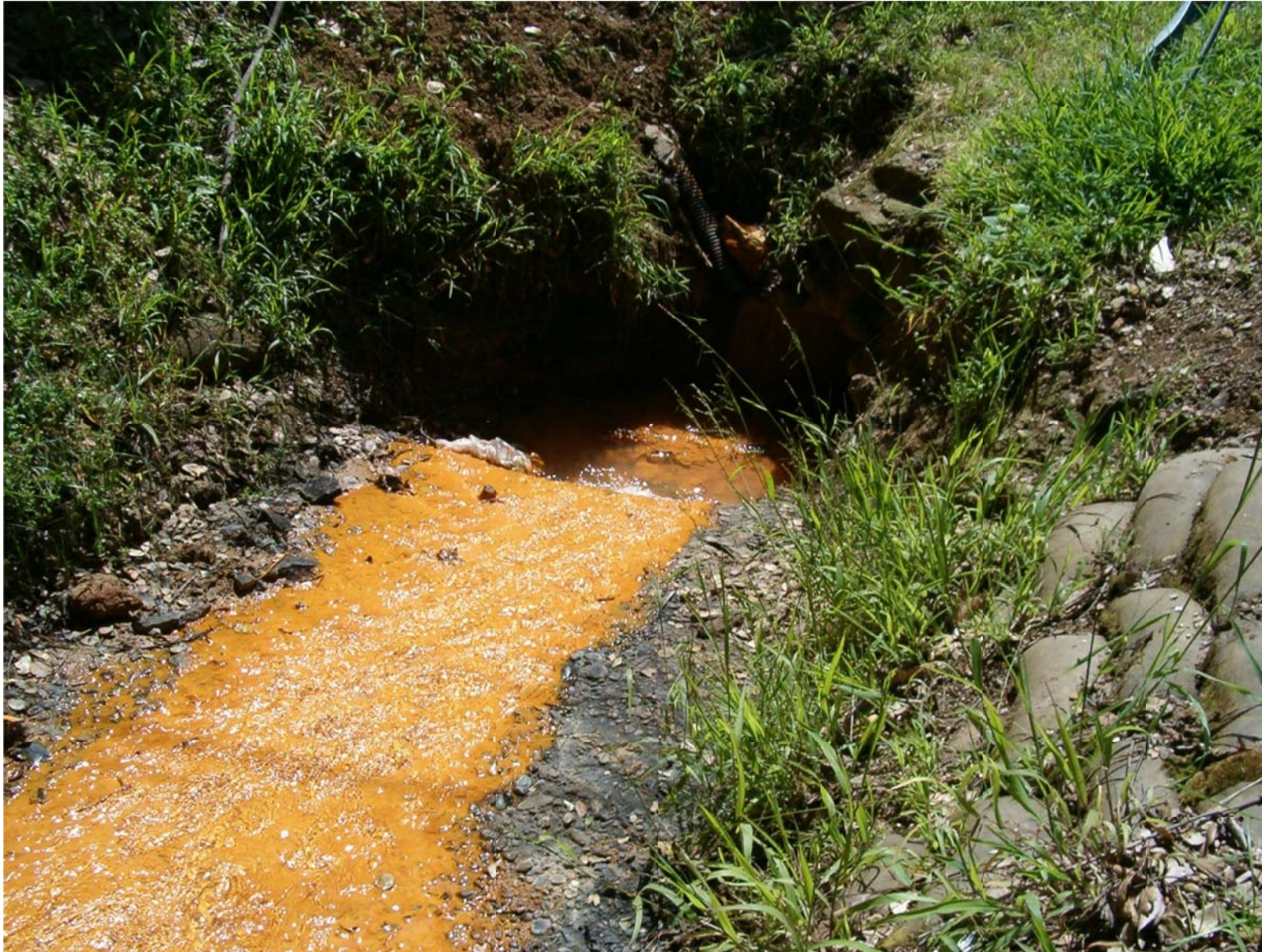
Figure 3. Leona Creek, discoloration from acidophilic bacteria