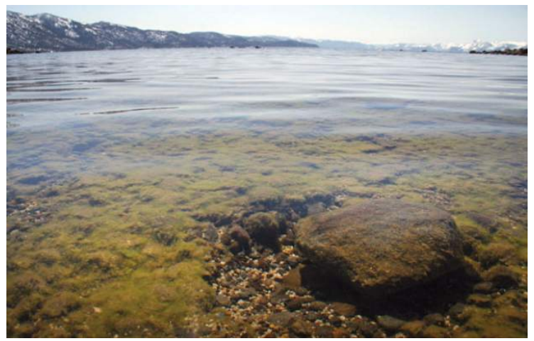
Figure 3. Periphyton at Burnt Cedar Beach, Incline Village

The public, research institutions and agencies, such as the Tahoe Regional Planning Agency, California Department of Parks and Recreation, and the Tahoe Resource Conservation District, have observed changes to the nearshore waters and the lake bottom. The anecdotal reports include increased algae growth, increased presence of invasive species, and a reduction in nearshore clarity. Figures 3-5 illustrate some of the observed nearshore conditions. The Regional Water Board, Nevada Division of Environmental Protection (NDEP), the Tahoe Regional Planning Agency (TRPA) and the United States Environmental Protection Agency (USEPA) (hereafter referred to as "nearshore agencies"), initiated the nearshore evaluation work documented in the Report to better understand current nearshore conditions, assess how best to monitor change, and establish the desired conditions and resource management objectives for the nearshore environment.