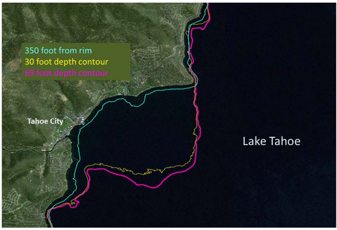
Figure 2. Nearshore area variation due to depth (NeST 2013)