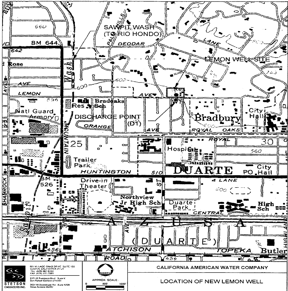
Figure 1. Site Location Map