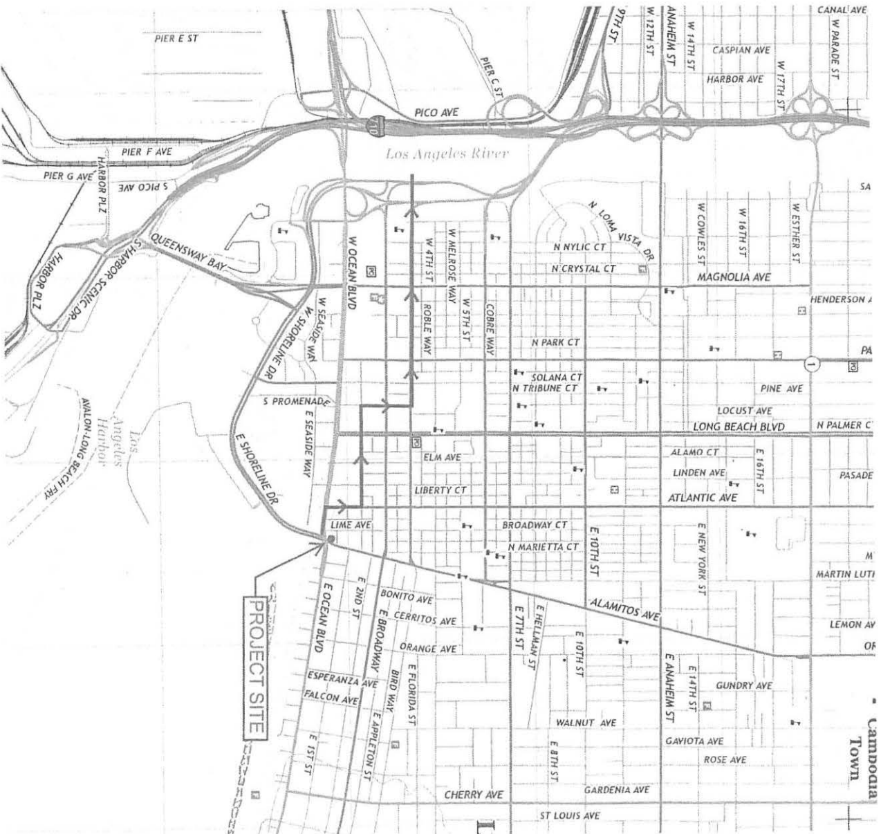
Figure 1. Site Map: 777 E. Ocean Boulevard, Long Beach