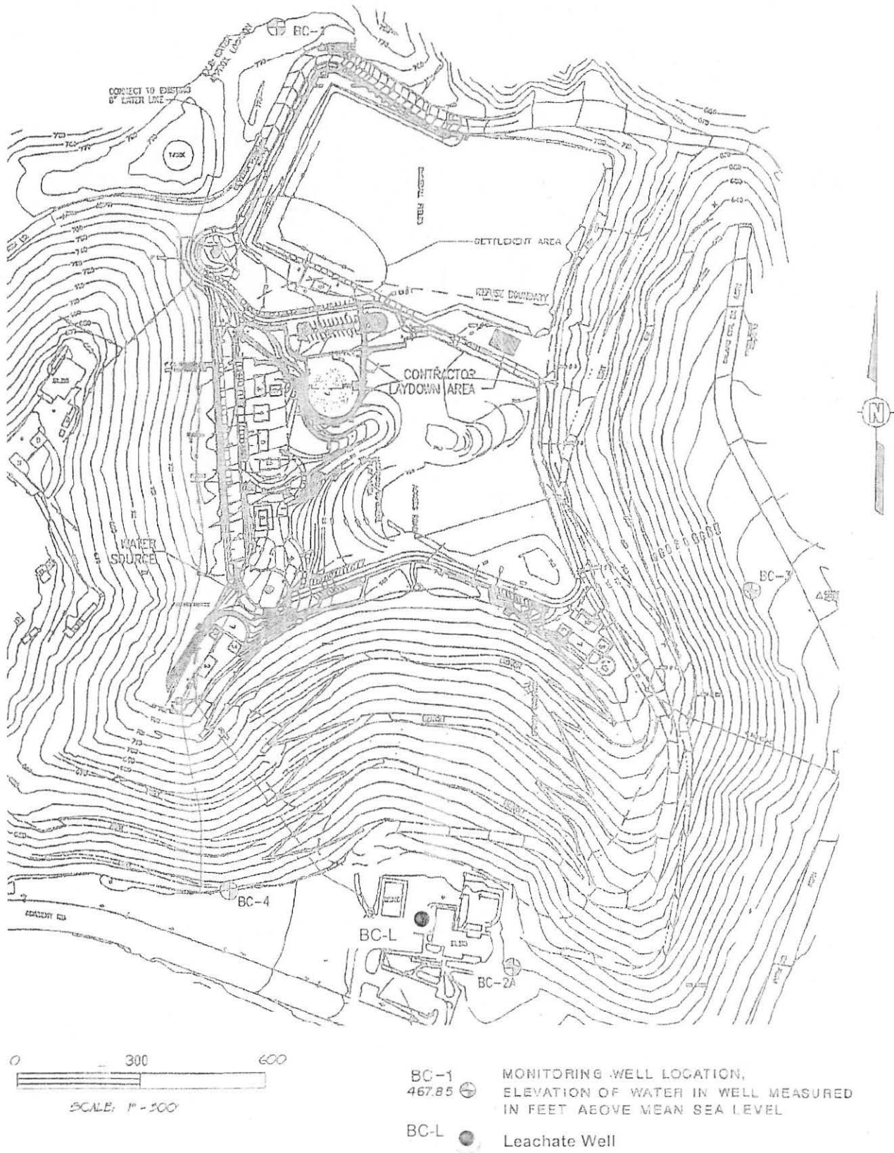
Figure 1. Groundwater Well and Leachate Well Locations