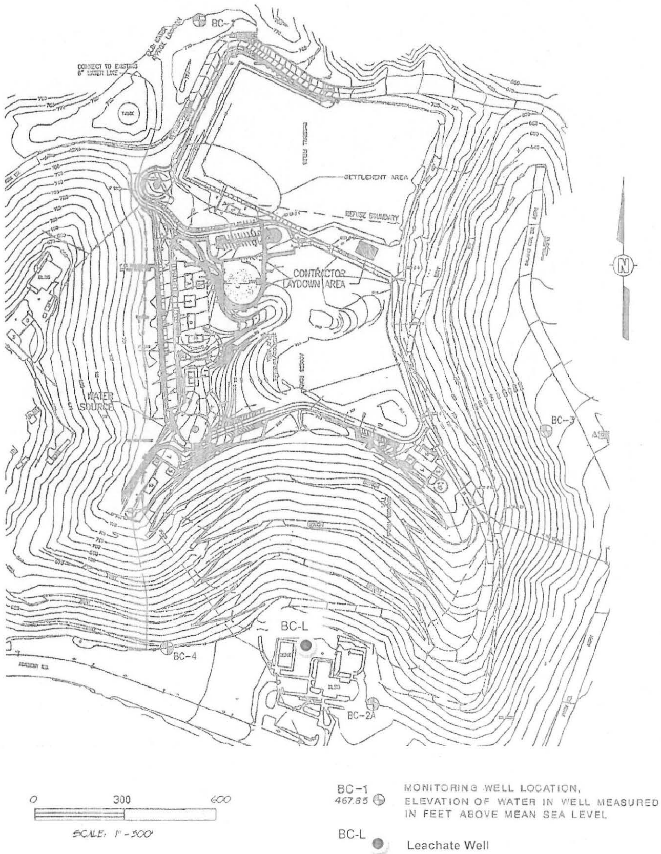
Figure 2. Existing Groundwater Well and Leachate Well Locations