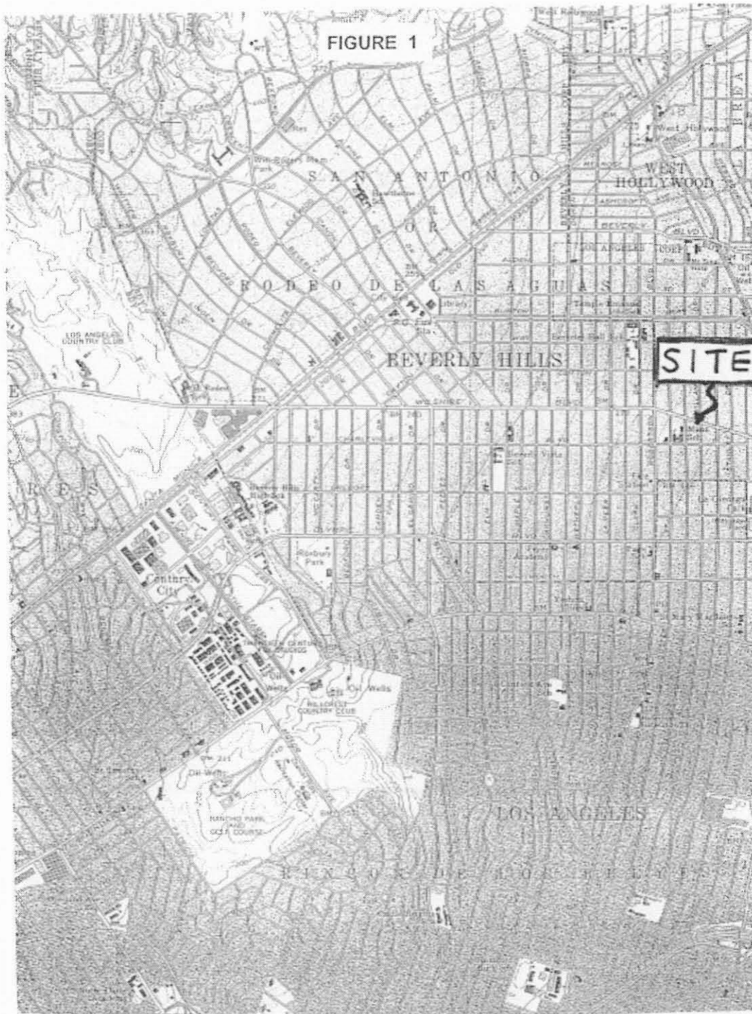
Figure 1. Site location map