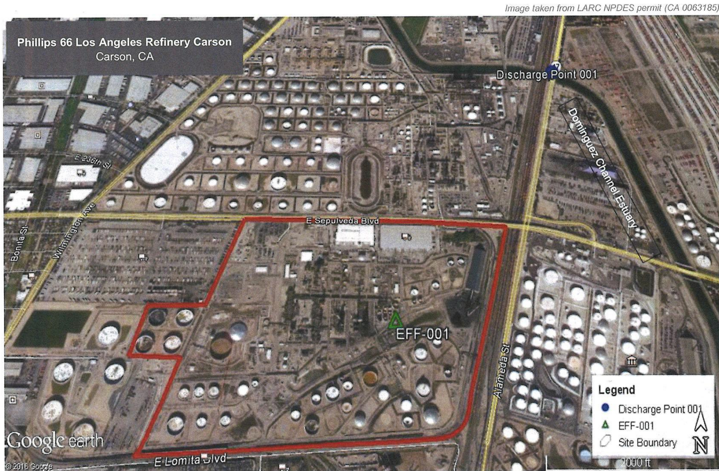
Figure 1: Site Vicinity Map and Discharge Point to the Dominguez Channel Estuary