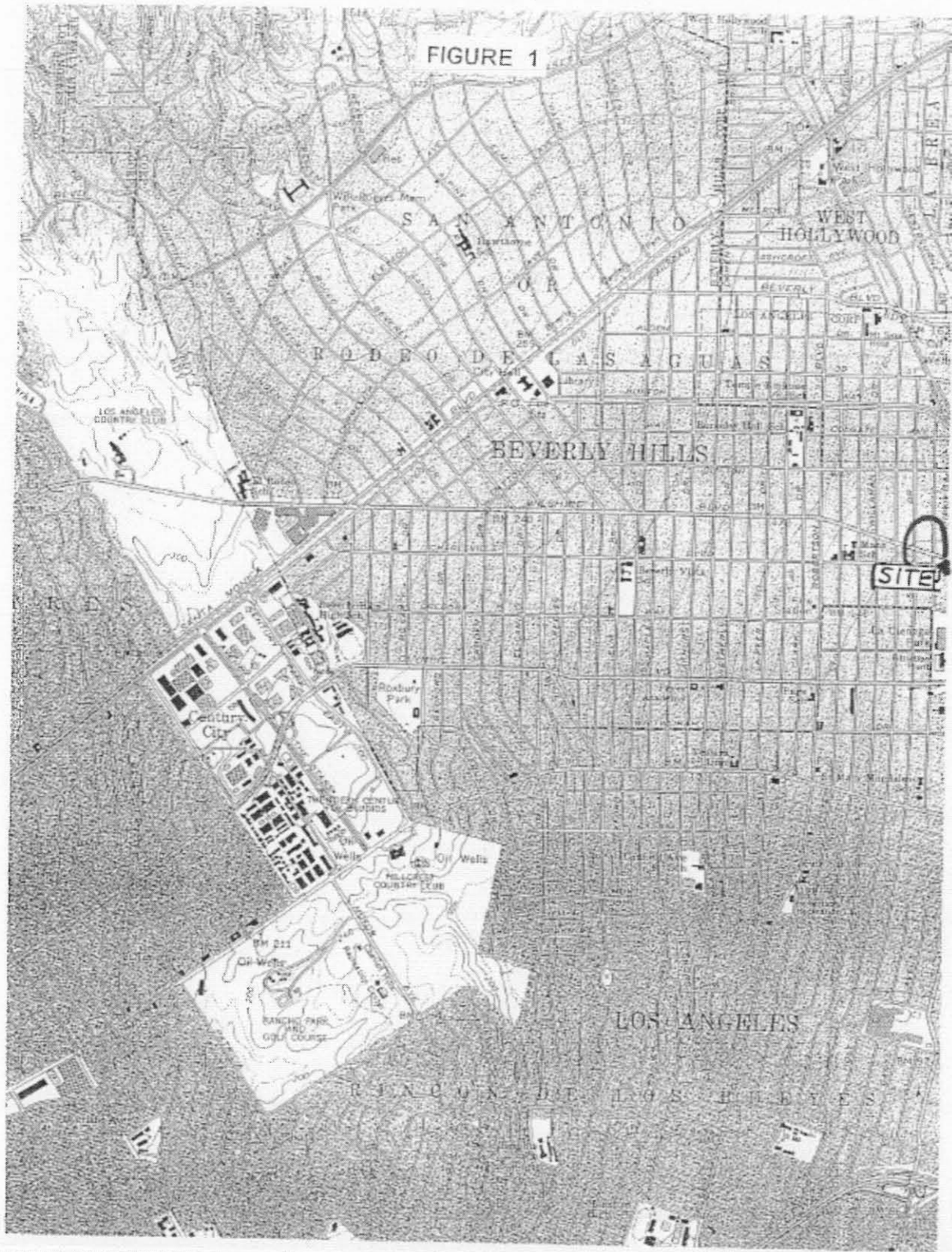
Figure 1. Site location map