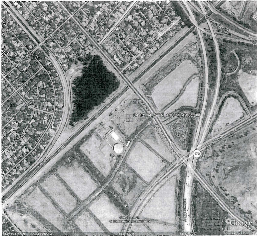
Figure 1. Tujunga Spreading Grounds and Well Fields