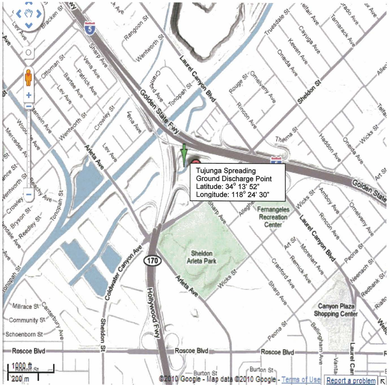
Site Location Figure 1