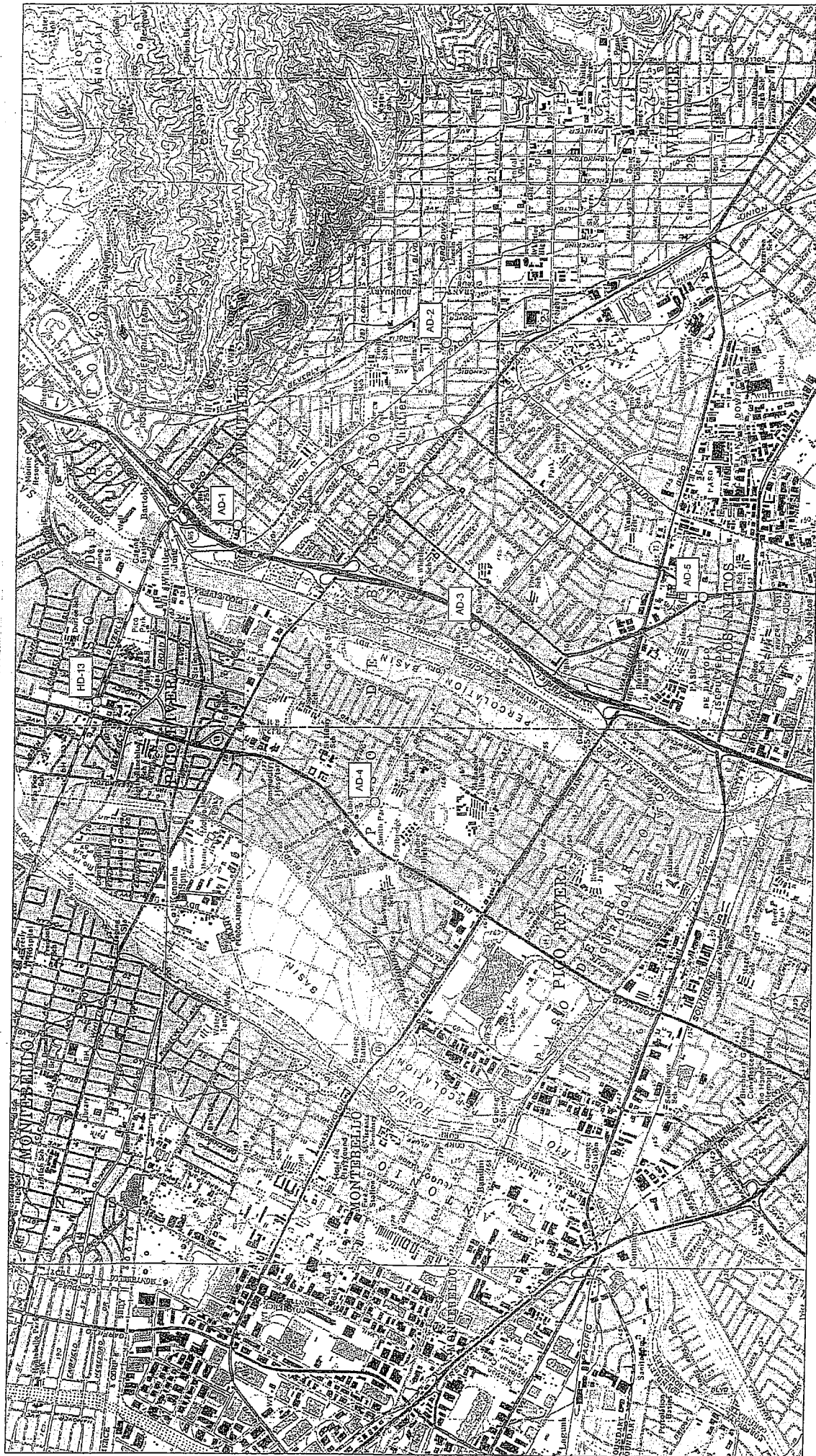
FIGURE 1.b CENTRAL BASIN MUNICIPAL WATER DISTRICT (CENTURY DISTRIBUTION SYSTEM)