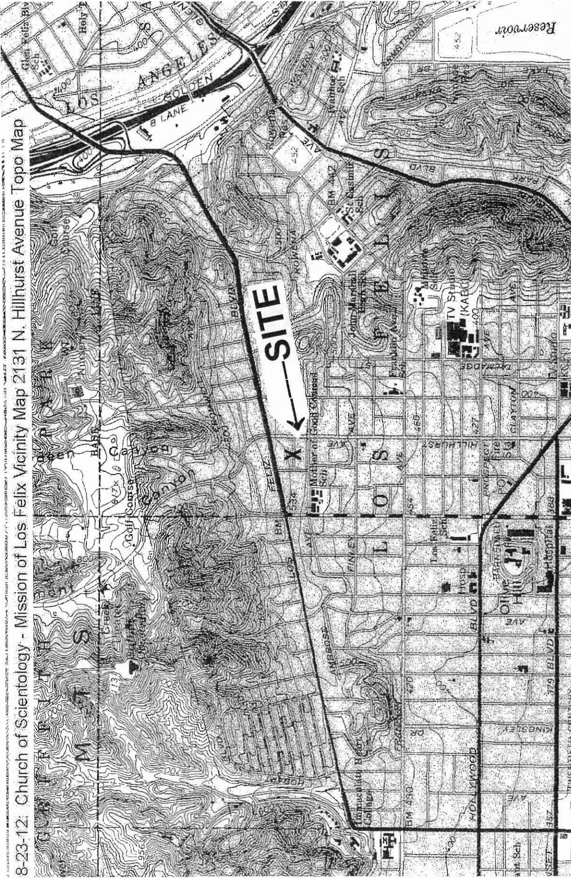
8-23-12: Church of Scientology - Mission of Los Felix Vicinity Map 2131 N. Hillhurst Avenue Topo Map