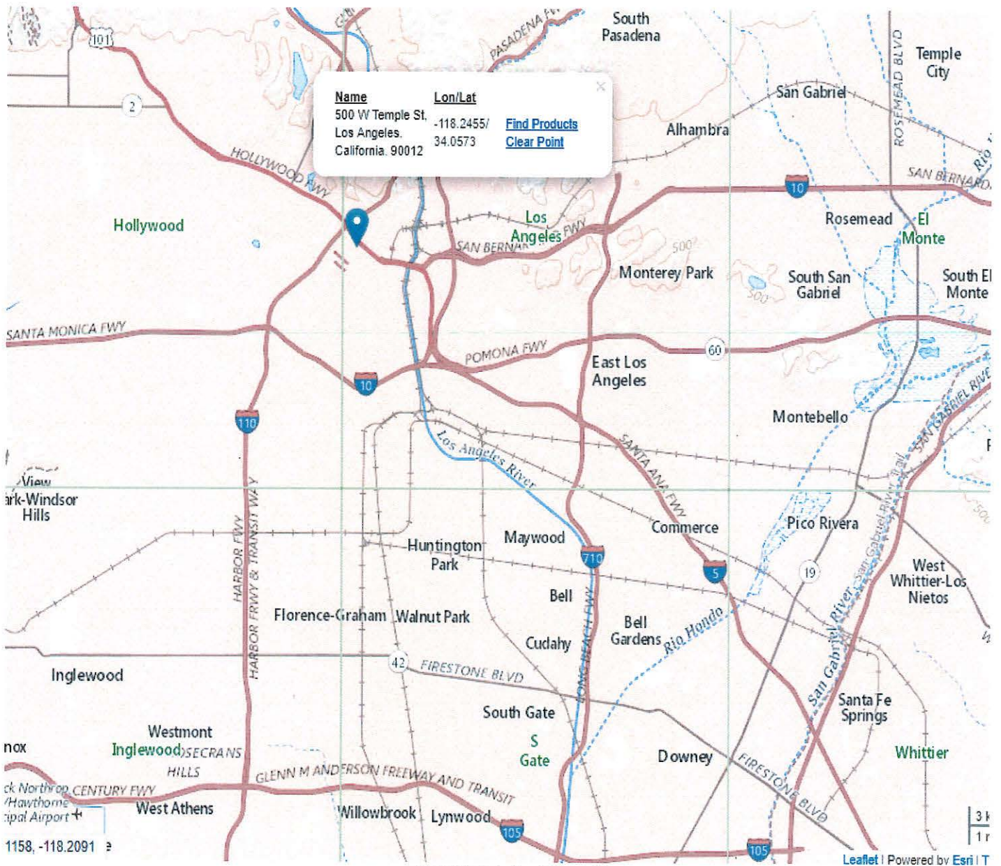
FIGURE 1—Site Map