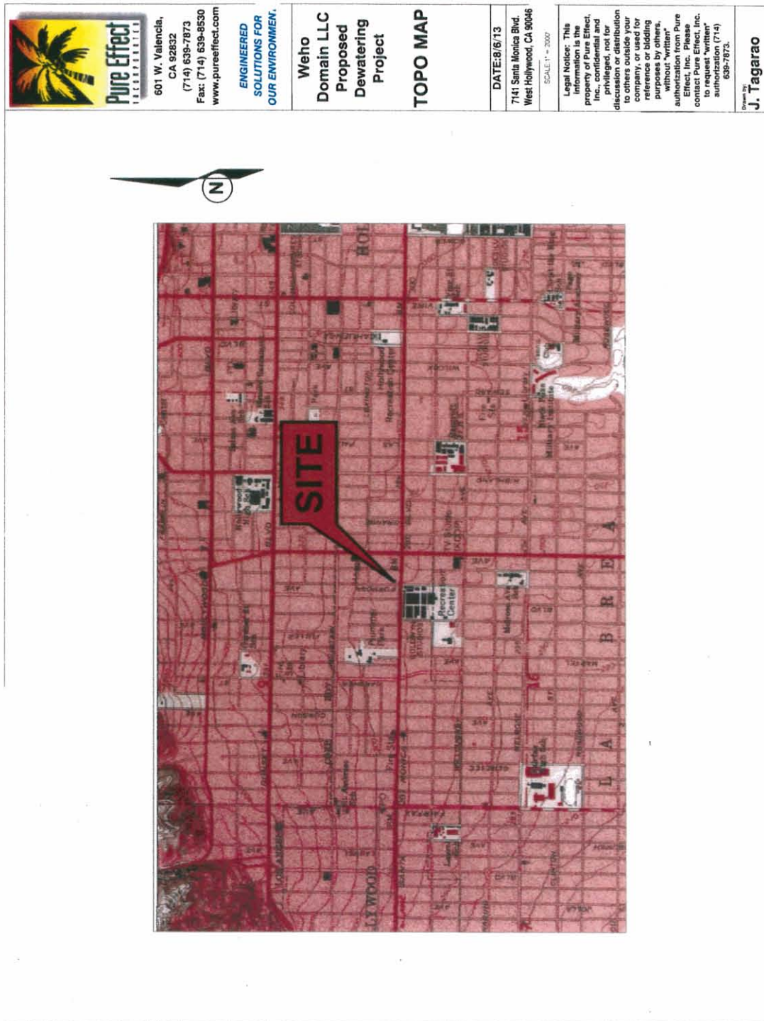
Figure 2. Site map